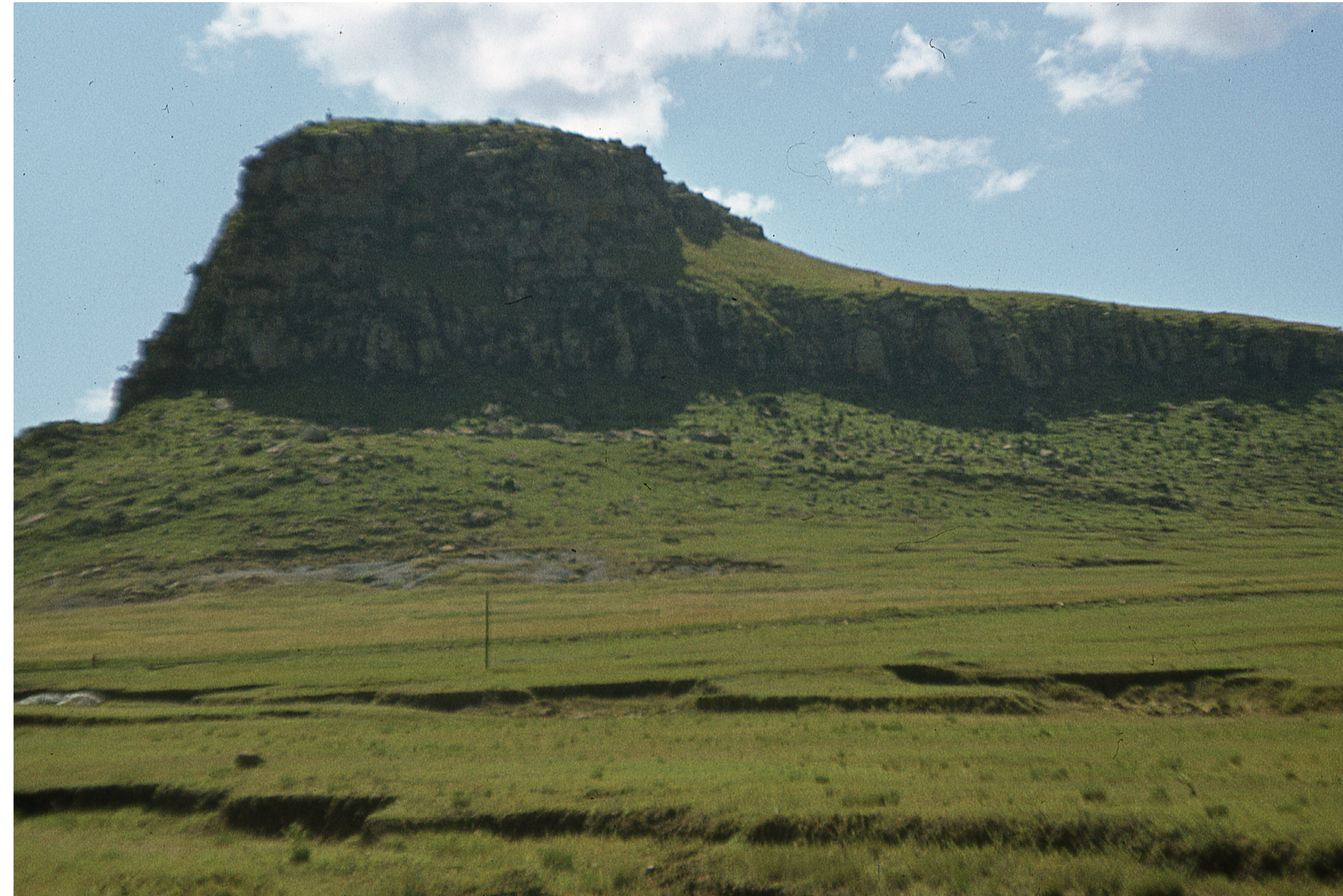
The Last Forever (Kamila Kuc & Scott Stark, UK/USA, 2023)

The audience also will be invited to participate in the unfolding of the narrative, voting on directions the story might take based on a number of choices, or even spontaneously suggesting new plot lines devised from visual cues provided during the performance.