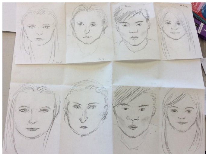
Figure 6: Workshop 5. Portraits drawn from subject and then redrawn from memory (Drawing Lab, 2015).

turned away from the subject, and drew a second picture of the subject from memory. Each person drew all members of the group. Feedback from this workshop described how students had memorised ratios and proportions to recall the distances between features and accumulated relevant information with each additional portrait. Participants reported an improvement in their ability to recall through repetition and heightened levels of focused concentration.