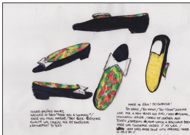
Figure 5: Workshop 4. Recollection of first pair of shoes (Drawing Lab, 2015).

For this workshop, students were asked to recall personal episodic information, specifically childhood memories relating to their first pair of shoes. They were asked to give form to personal items.