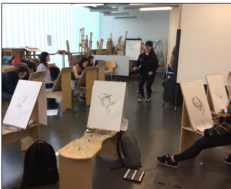
Figure 2: Workshop 2. The life model is seated behind the screen on the right, a student returns to add to her drawing (Drawing Lab, 2015).

The second workshop examined the ability to gather and recall information about a 'remote target', a life model located behind a screen, hidden from the viewer and separated by some distance. Students were given 1 minute to view the pose and then returned to their drawing space, gradually compiling drawings from short-term memory recall. This workshop required them to devise specific information storage techniques. After completing the drawing, participants were asked to write a paragraph of text documenting the techniques they used for recall.