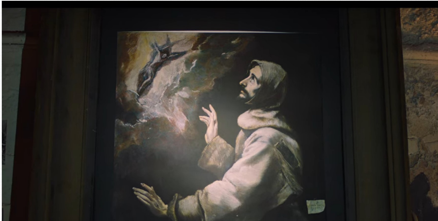
Still from Deadwind S3 E4 showing a reproduction of El Greco's St. Francis Receiving the Stigmata (around 1590).