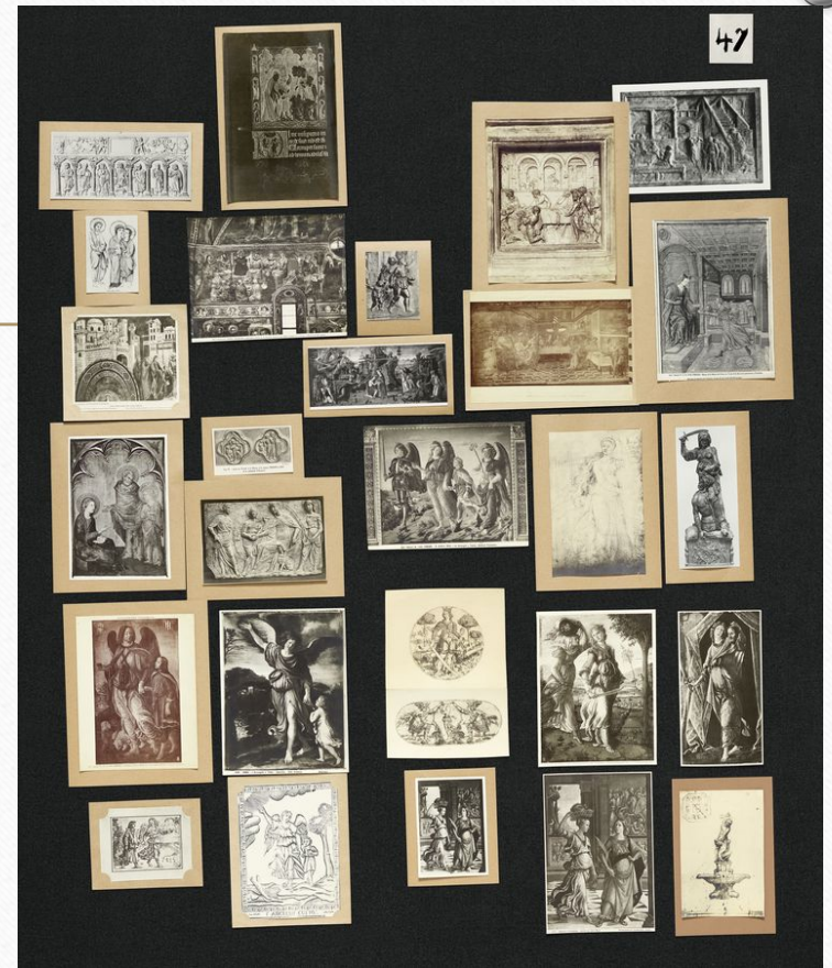
(left) Re-creation of the Bilderatlas Mnemosyne at Haus der Kulturen der Welt, Berlin, 2019, (right) detail of panel 47