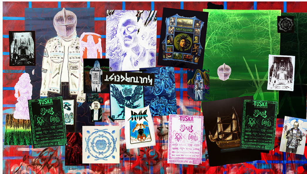
Tom Cardwell Iron Man 2023 digital print based on original paintings 340 x 190 cm