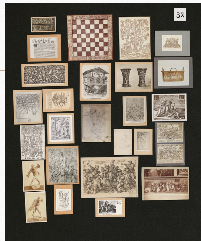
(left) Stills from Deadwind S3 E4, (right) Re-creation of Panel 32 from Aby Warburg's Mnemosyne Atlas