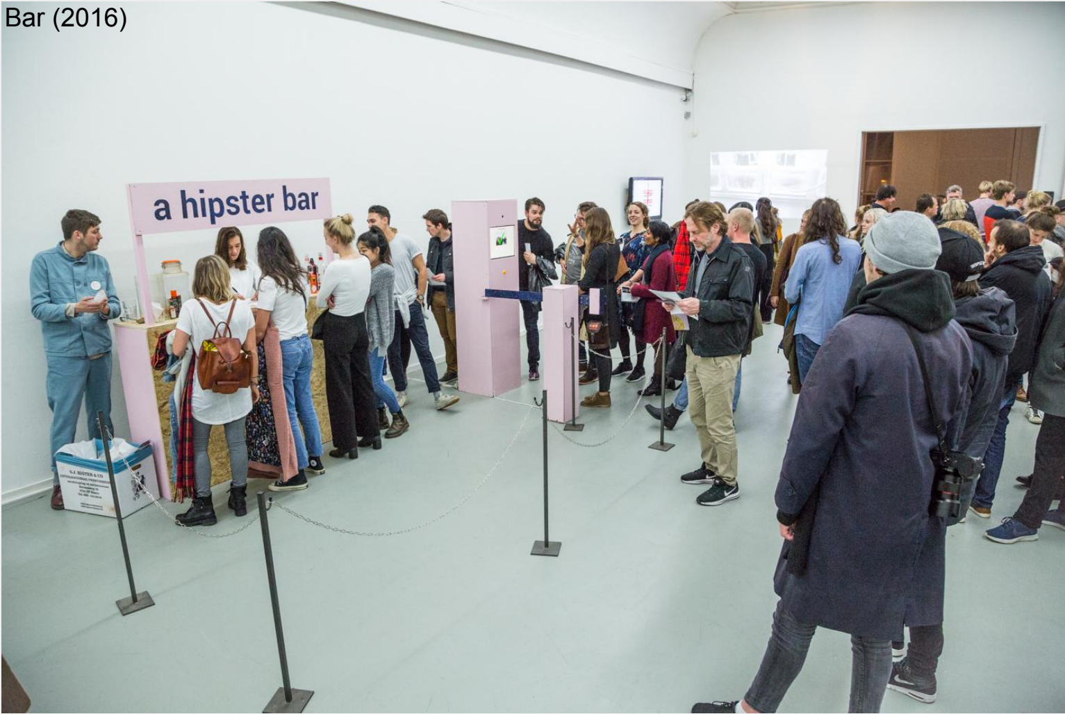
A Hipster Bar (2016)