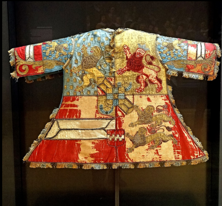
Heraldic tunic from the house of Orange-Nassau, 1647, Rijksmuseum, Amsterdam