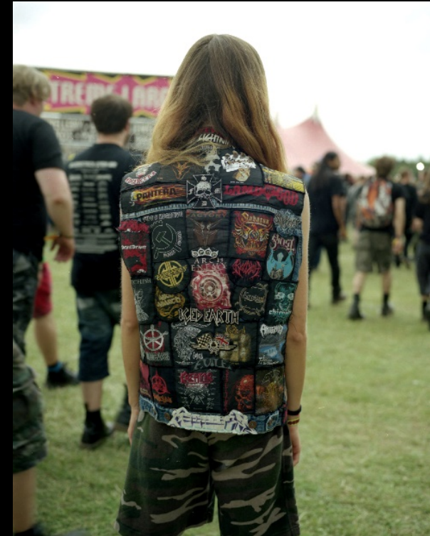
Tom Cardwell Installation of jacket and fan photos, London, 2017 Dimensions variable