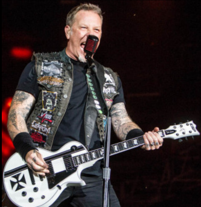
Metallica's James Hetfield often wears his battle vests to perform