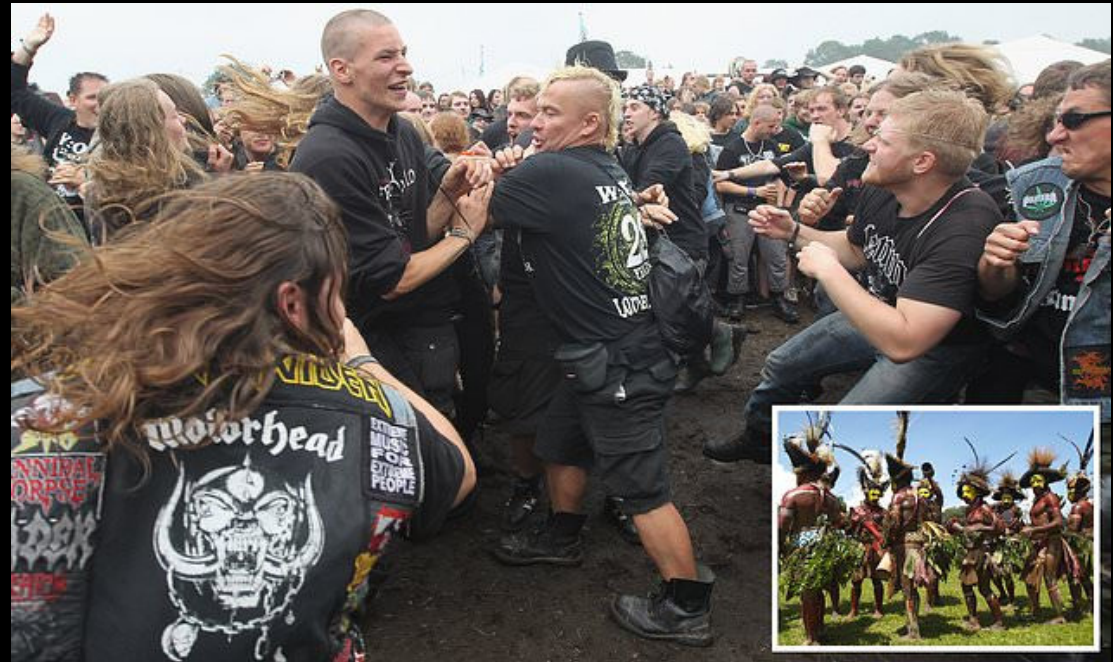
Moshpit photo from research by Linday Bishop featured on undelete.news