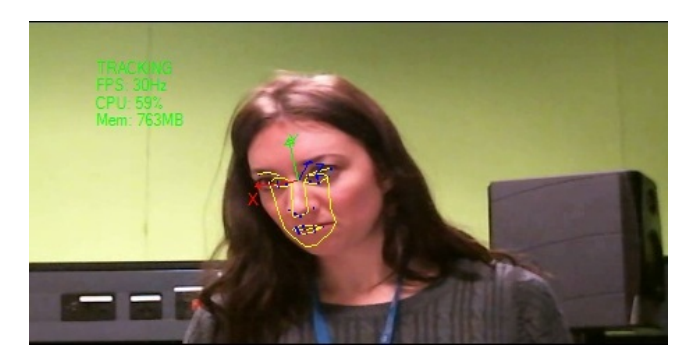
Fig. 4. Face Tracking

between the piano, the robot and elsewhere. Initial tests for differences between the groups based on mean times spent in each state across the whole session indicated that Condition B spent significantly more time looking at the piano, t(8)=-3.928, p=0.004, and spent significantly more time in a thinking state t(8)=3.402, p=0.009. All other results showed no significant difference between groups. However, social and task-related context is crucial when attempting to infer information about the user's affective state or level engagement [20] so it is arguable how much insight we can gain from a contextless measure that completely ignores what else is happening during the session. For instance, looking at the piano while playing could suggest concentration, whilst looking at the piano while not playing could suggest shyness or avoidance. Or, since the interface was placed on top of the piano, spending time looking at this when not playing could be explained by participants changing parameters.