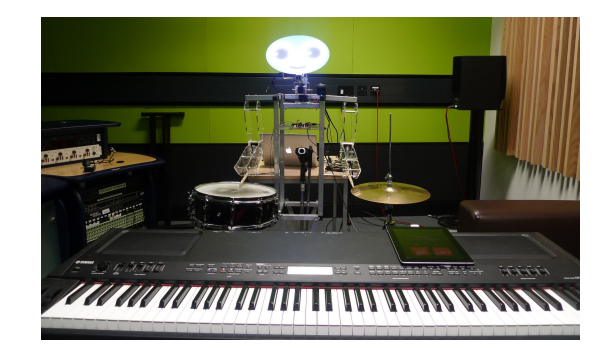
Fig. 1. The Robot

Within Interactive Music Systems (IMS) for duet improvisation, the matching of piano to percussion is uncommon, with most systems taking the homogenous approach of matching percussion with percussion or keyboard to keyboard. For instance, The Continuator [24], Mimi [25] and Shimon [26] construct a model of the users piano input and use this to generate stylistically appropriate tonal response. Motivated to creative ends, the majority of research favours openness of outcome over stability which, as we will elaborate upon in Section III, does not necessarily serve us well. An example of a more stable system is the UK Garage generator for composing subtly varying beats described by