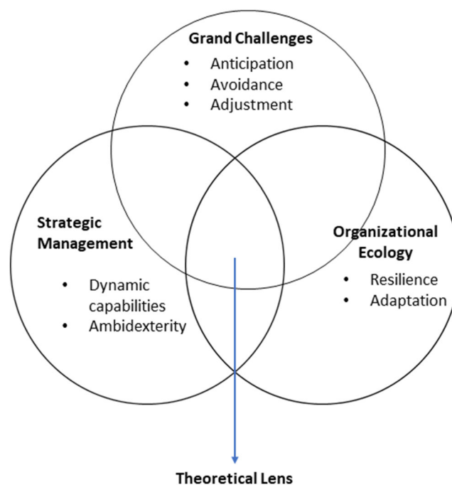
FIGURE 1 Systemic theoretical framework.

In order to build a compelling exploratory case study, the data collection protocol was structured according to two main steps (Piekkari et al., 2009). The two-step process has been shown in Table 1. In the first step, we conducted extensive desk research on the overall response of the Italian fashion industry. Data collection involved the consultation of a vast array of secondary sources such as web articles (2), videos (4), newspaper clippings (17) and in-depth screening of the grey literature such as industry and consulting reports (5) as highlighted in Table A1. These secondary data collected were organized according