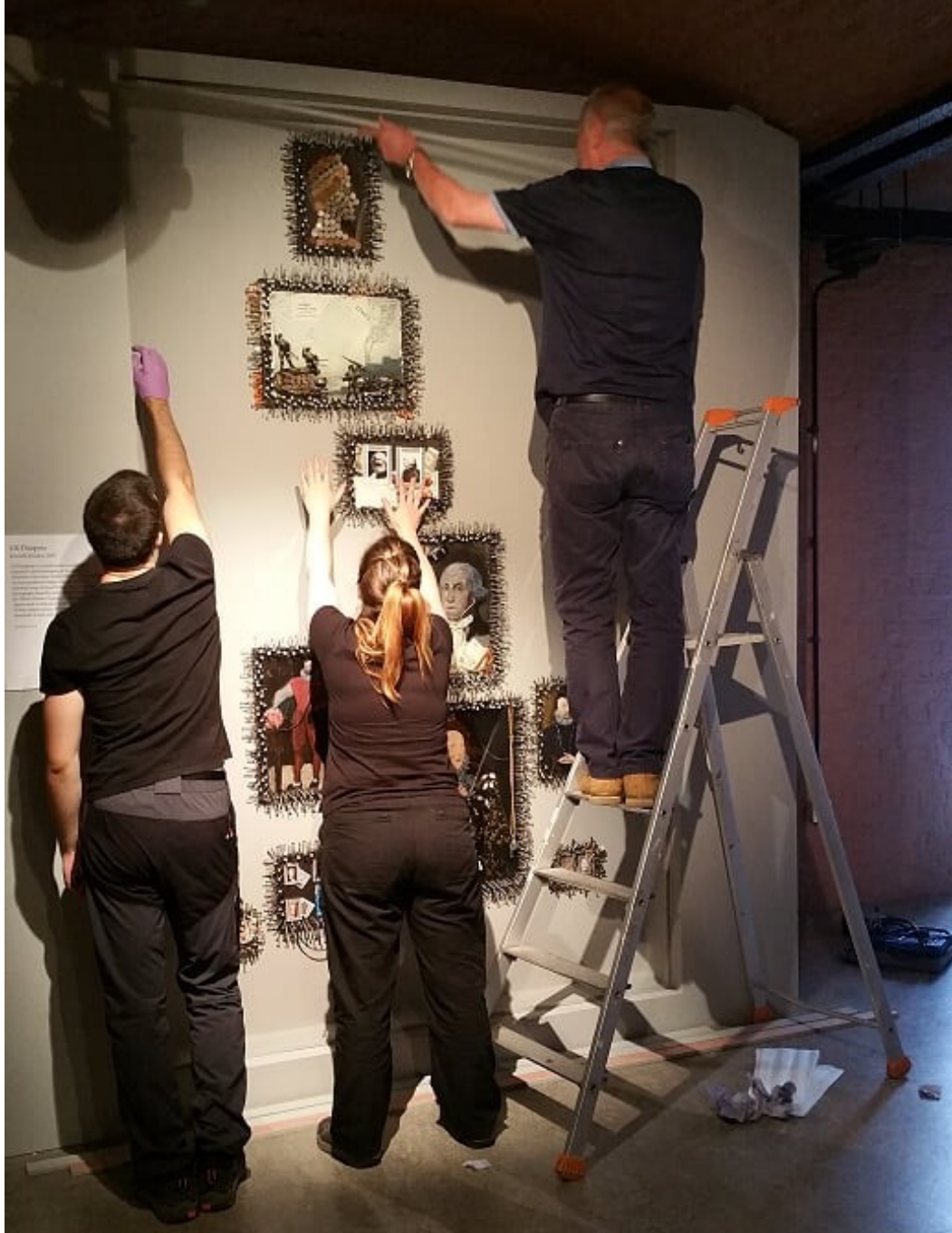
2017: Installation of UK Diaspora at the International Slavery Museum