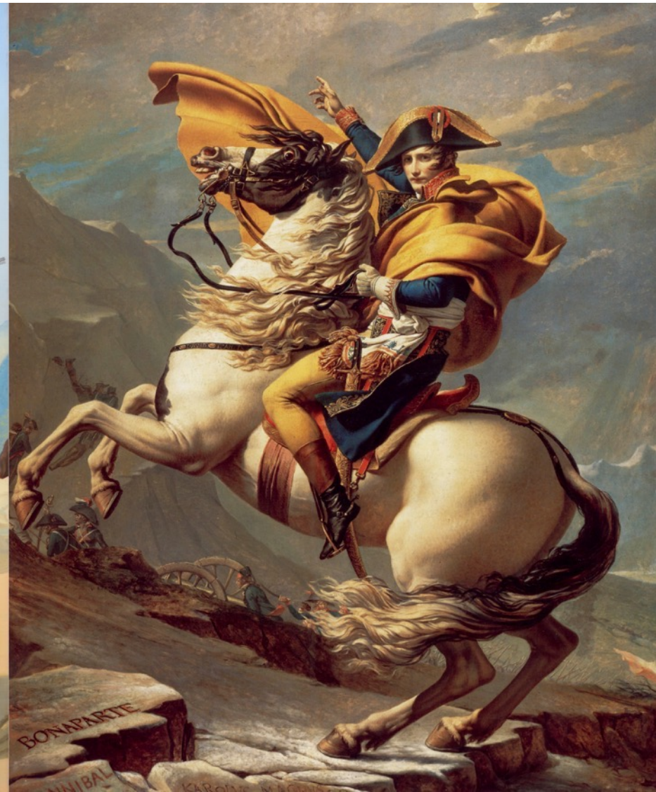
Jacques-Louis David, 'Napoleon crossing the