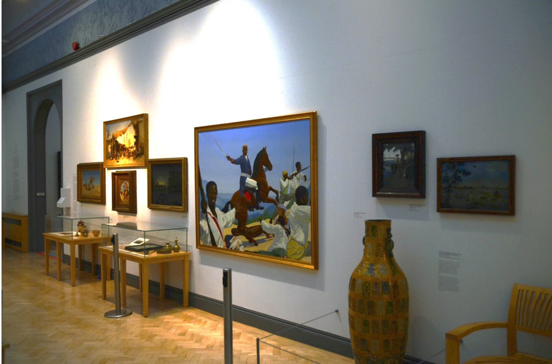
2018: Wolverhampton Art Gallery