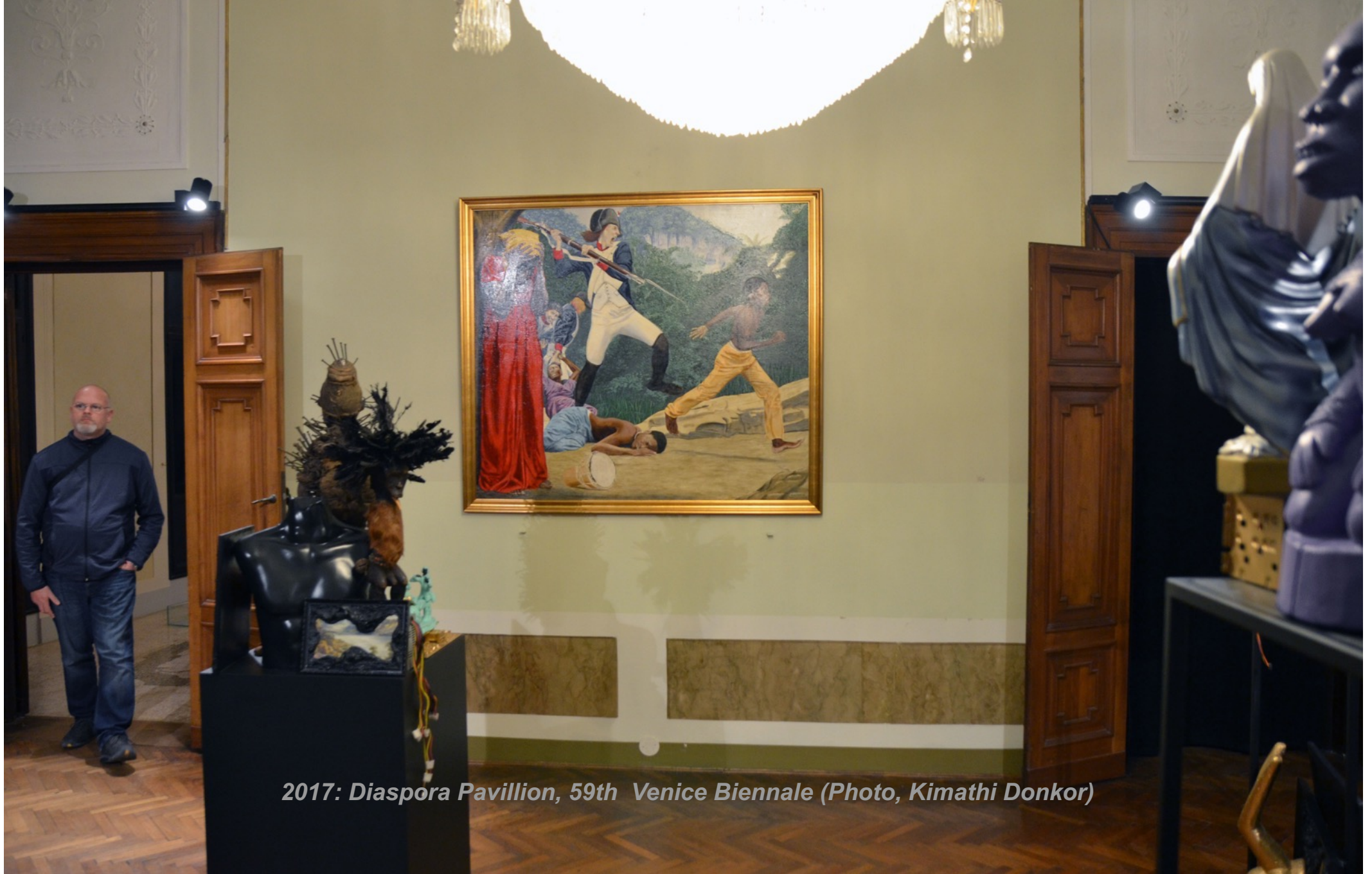
2017: Diaspora Pavillion, 59th Venice Biennale