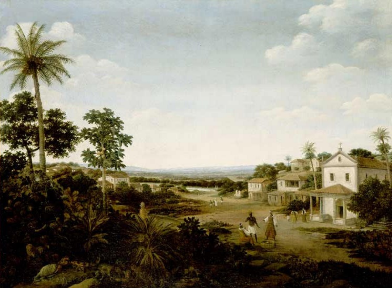
L. Frans Post Landscape in Brazil , c.1665-9