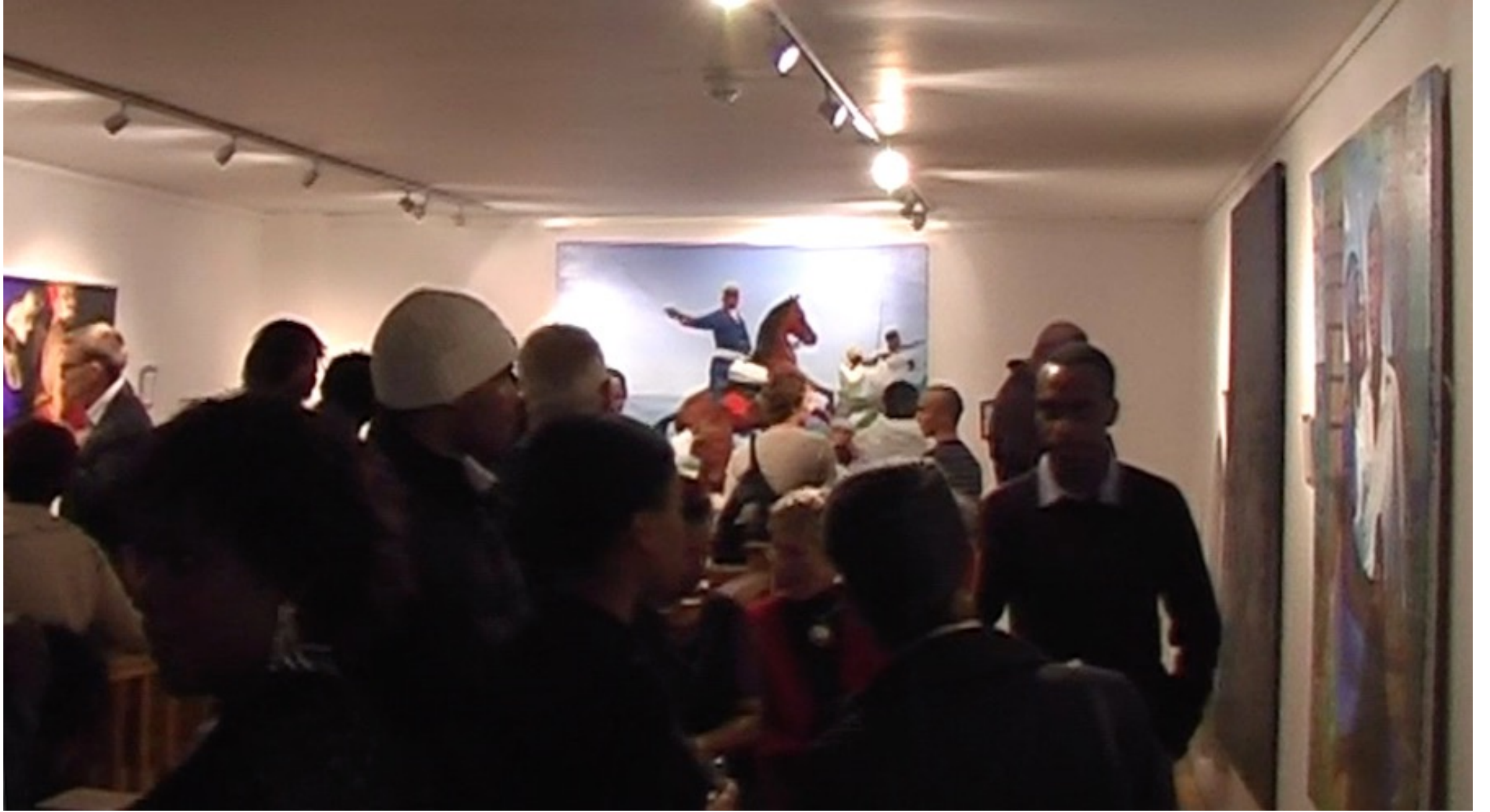
2004: Opening of '1804: Caribbean Passion' at the Bettie Morton Gallery, Brixton, London.