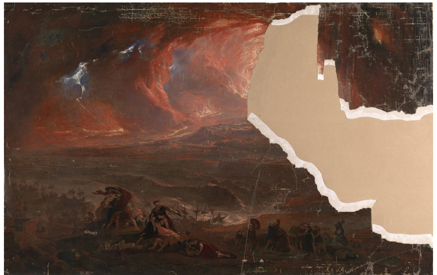
Figure 2 The painting after varnish removal

passages exceptionally difficult to read. Moreover, it was distorting the intentionally lurid colours of the scene to the extent that it was severely undermining the artist's intention to provide a sublime image. The colour was a striking factor when the painting was first executed and was commented on by many of the contemporary viewers who reviewed the original 1822 Egyptian Hall exhibition. Note was made on the '...excess of the brilliant hues of the Artist's palette' (European Magazine, April 1822) and the '...too palpable an obtrusion of colour' (London Magazine, May 1822). The visual benefits of cleaning were clear in re-establishing the dramatic palette and mood of the work (Figure 2). However, the process was not without its risks. Original resinous glazes applied in certain areas presented complications, especially given that non-original glazes (seemingly applied to mask damages that had occurred prior to the flood) were also present. Widespread cross-section examination enabled the identification of original and non-original glazes which informed the cleaning process.