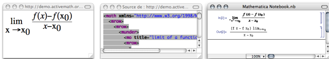
Figure 2: A difference quotient expression in MathML-presentation is on the left. For it to be copied one needs to copy its source which can then be pasted into Mathematica which recognizes automatically. However, the semantic interpretation of Mathematica, obtained by pressing the return key, is somewhat surprising! The same procedure in Maple yields an error at interpreting the limit.