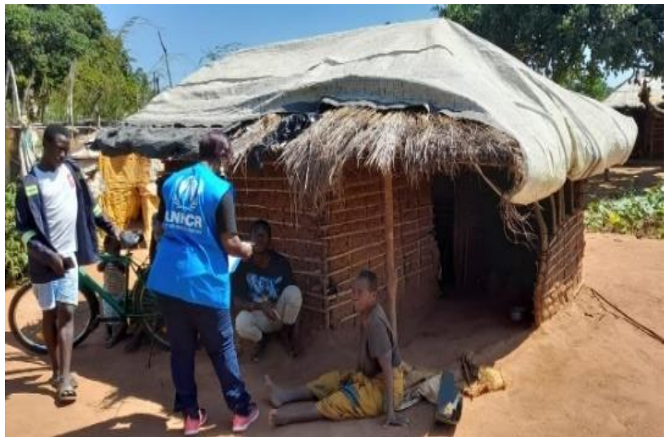
UNHCR assessing transitional shelters in Nicuapa displacement site in Montepuez district