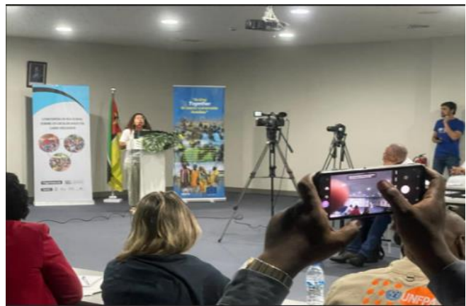
National conference on IDPs in Cabo Delgado.