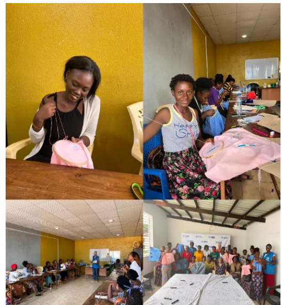
Embroidery workshop in Maratane Refugee Settlement.