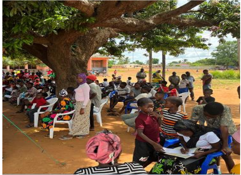
Civil documentation and legal assistance in Namialo district

■ Possessing civil documentation is crucial enabling displaced people to access services, including healthcare and education and enhancing their freedom of movement. During April 2023, UNHCR through its partner the Catholic University of Mozambique