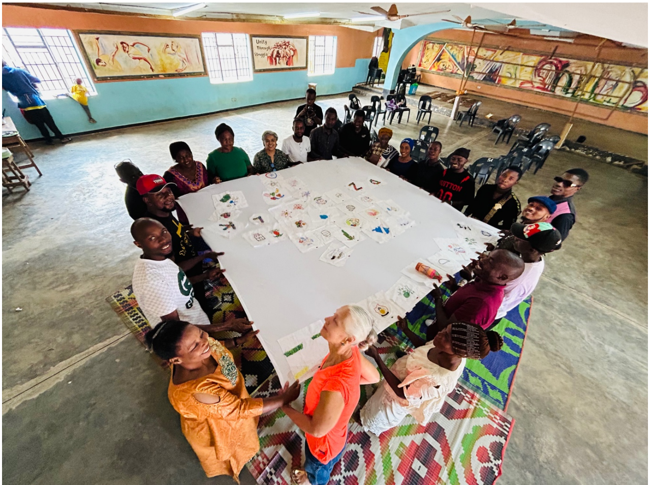
Group image displaying unique embroideries created, at the end of the workshop.