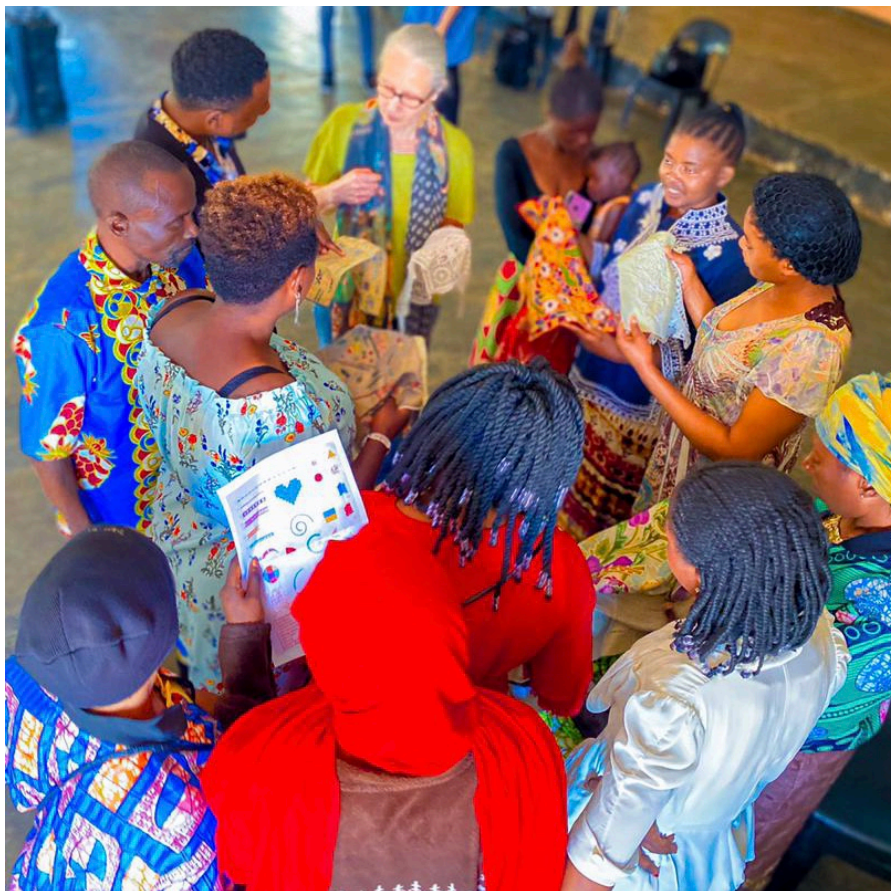
Salama Africa – meeting the making community May 2023

25 refugee participants took part in this workshop.