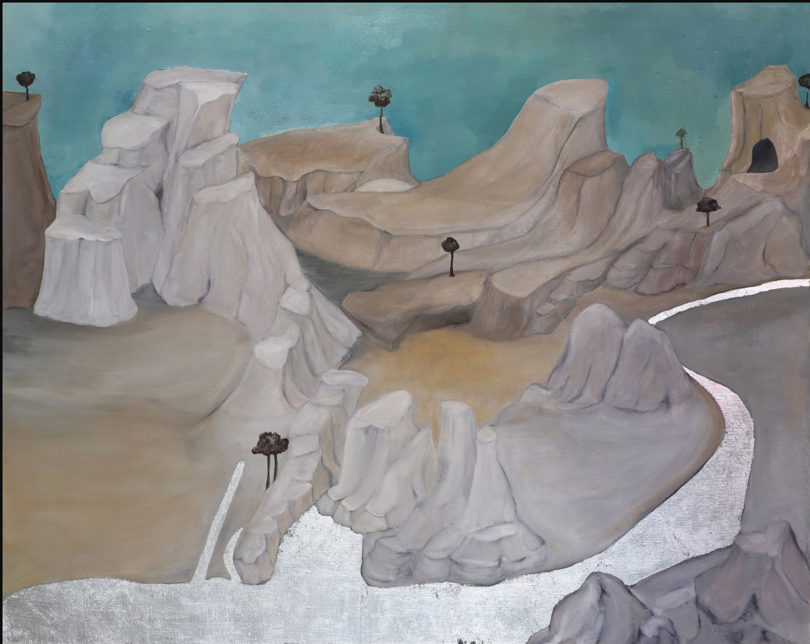
Henrietta Simson, After Thebaid , 2020, 150x120cm, oil and metal leaf on linen