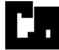
Carl Andre icon designed by Vier5.