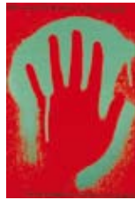
Altamira. Environmental poster, 'We are for air in Berlin', 1990.