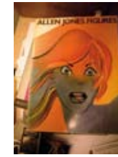
Allen Jones’ Figures, book cover, Edizioni O., Milan 1969.