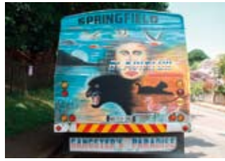
Africa. An example of Durban's privately owned and operated buses. Most bus lines are Indian owned and operated.