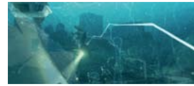
Abstracted landscapes. Still from Radiohead's video clip Pyramid Song. Animation and artwork by Shynola.