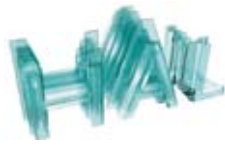
2001: A Space Odyssey. Three-dimensional visualisation of the word HAL, as pronounced in the film. Part of the project Speech Recognising Letterforms by Andreas Lauhoff / 3deluxe.