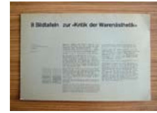
Acht Bildtafeln Zur Kritik Der Warenästhetik (Eight Colour Plates On The Criticism Of Consumer Goods Aesthetics).