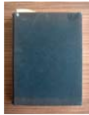
American Woodtype 1828–1900 by Rob Roy Kelly. Book cover.