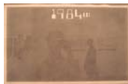
1984, lithograph by Ed Ruscha.