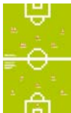
11 Designers For Germany. Poster for the initiative.