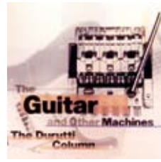
8vo, The Guitar And Other Machines record sleeve designed by 8vo for the band The Durutti Column.

is hopeless. One strike away from losing the World Series, Mookie Wilson's at-bat led a Mets rally from which the Boston Red Sox didn't recover for seventeen years." MICHAEL BIERUT