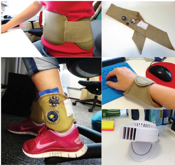
Figure 3.2: Personal Cooling Devices, clockwise from top left: cooling body wrap, cooling neck tie, wrist cooler, personal cooling fan, and ankle coolers.

Each device was tested by two participants during the studies. The cooling neck tie and the wrist coolers were tested by three participants.