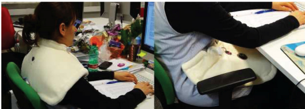
Figure 4.1: Appropriation of the heated shoulder pad.

“thin and large enough to bend/fold for using on different body parts” (H3).