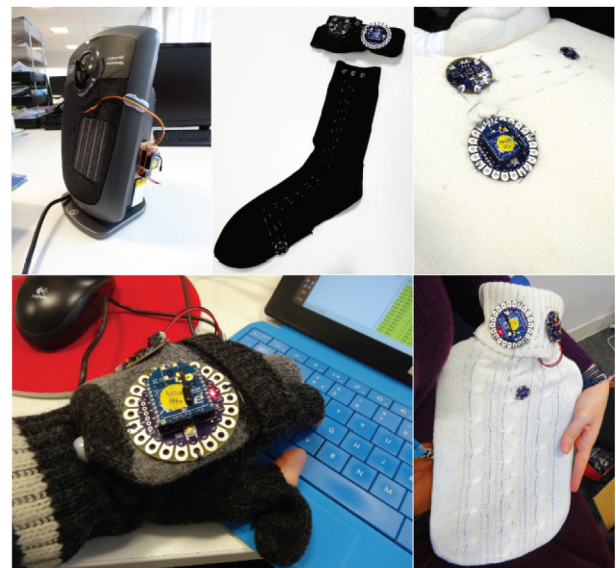
Figure 3.1: Personal Heating Devices, clockwise from top left: personal fan heater, heated socks, heated shoulder pad, heated gloves, and hot water bottle.

For the study on personal heating, we selected commercially available heated gloves (Mobile Fun Limited 2015), a heated shoulder pad (Beurer GmbH 2015), heated socks (blazewear 2014), a hot water bottle (E-Bargain UK 2015), and a personal fan heater (De'Longhi UK 2015), all of which we equipped with a temperature sensor and XBee radio circuit to transmit device temperature information (fig. 3.1). Apart from the hot water bottle, which was filled with hot water by the participant, all other personal heating devices featured heat pads or heat strings to provide heat and either ran on battery or had to be plugged into USB or mains.