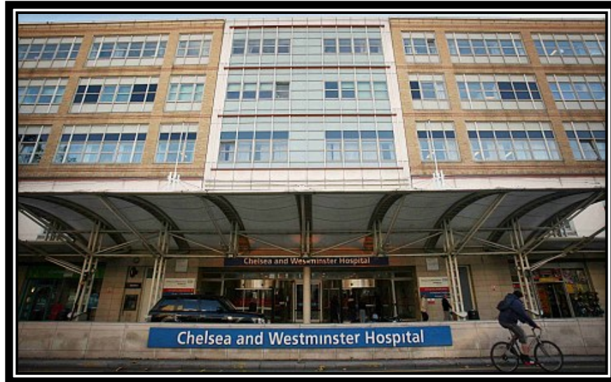
Chelsea and Westminster Hospital