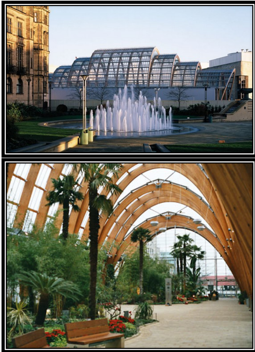
Winter Garden Sheffield