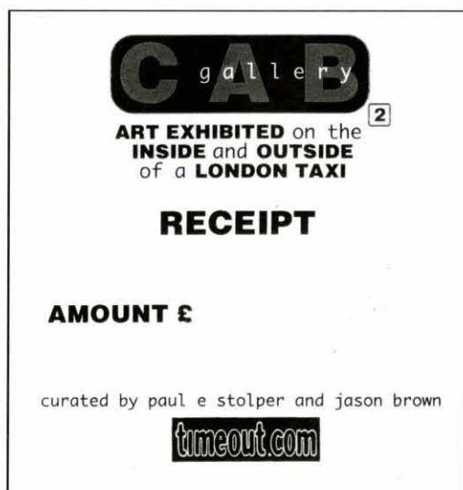
Receipt from the Cab Gallery, Jason Brown c.2000.

Visits to institutions with similar collections proved useful in planning the future needs of the Chelsea collection. These were: in London, the National Art Library (NAL) and the British Council; and in New