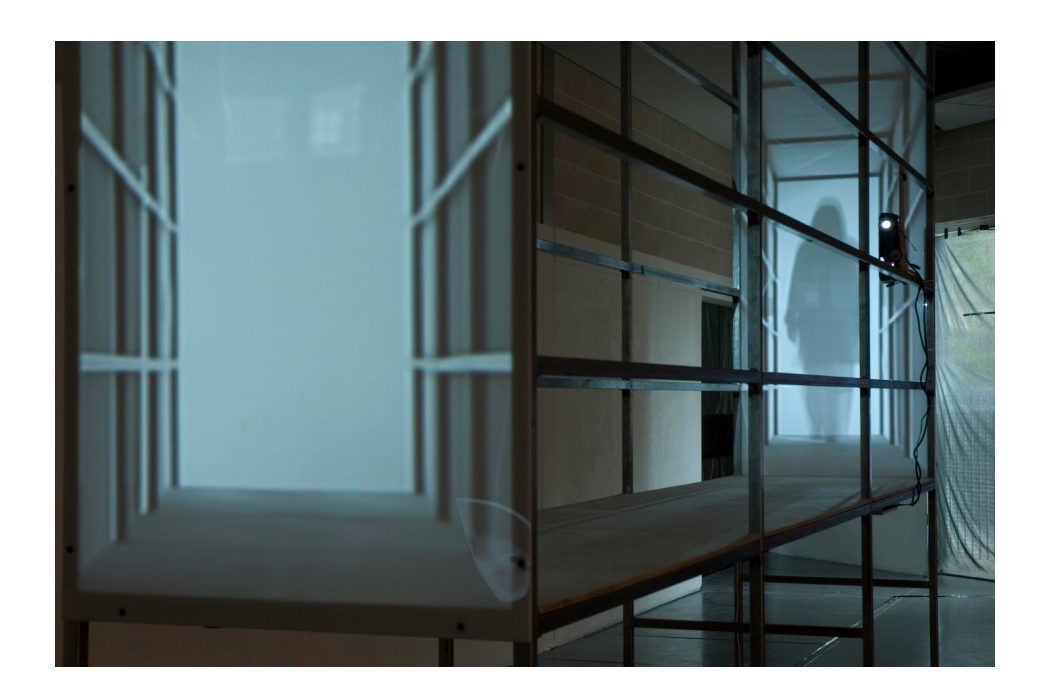
FIGURE 12. Ken Wilder: Intersection. (2006).