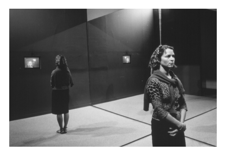
FIGURE 8. Dan Graham: Present Continuous Past(s) (1974).

to heighten the conditions of spectatorship, but in order to expose the 'illusory' and 'ideological' construction of the image as spectacle (though we should here refer back to misunderstandings as to the illusory nature of film). Though we might question some of the underlying Debordian assumptions, what is indisputable is that such practices foreground the very apparatus that many contemporary digital video installations now seek to hide: drawing our attention to the mechanisms of projection, the configurational properties of the photographic rather than theatrical presentation. Here, far from overcoming the 'theatricalizing' of the image (leaving aside any reservations about the applicability of Fried's term), like minimalist art these works insist on a non-referential and material film practice. One might think of the 'light sculptures' of Anthony McCall [Figure 7], which go as far as to deny any implied filmic space, shifting attention to the cone of light so reminiscent of smoky cinemas. Like minimalist sculpture, these 'films' are manifest only in real time and real space. Other film and video artists highlight configurational properties by means such as exploiting the sculptural properties of monitors, the technical limitations of the media, or emphasising the materiality of the film strip or individual frames.