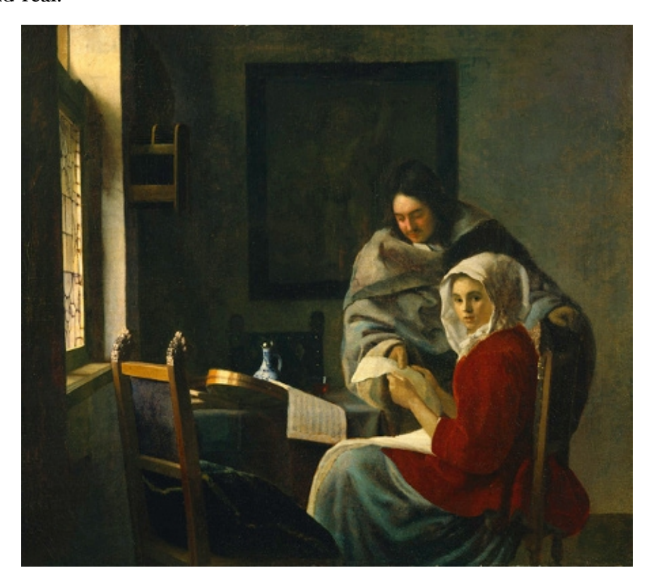
FIGURE 2. Johannes Vermeer: A Girl Interrupted at Her Music (c.1660-61), The Frick Collection, New York.

2]. The much tighter framing of the image and greater intimacy suggests an interruption that is now entirely internal to the scene, an intrusion within the inner logic of the work's narrative. The implicit spectator the woman addresses now inhabits the space of the representation as a familiar presence that no longer transgresses the metaphysical divide between fictive and real.