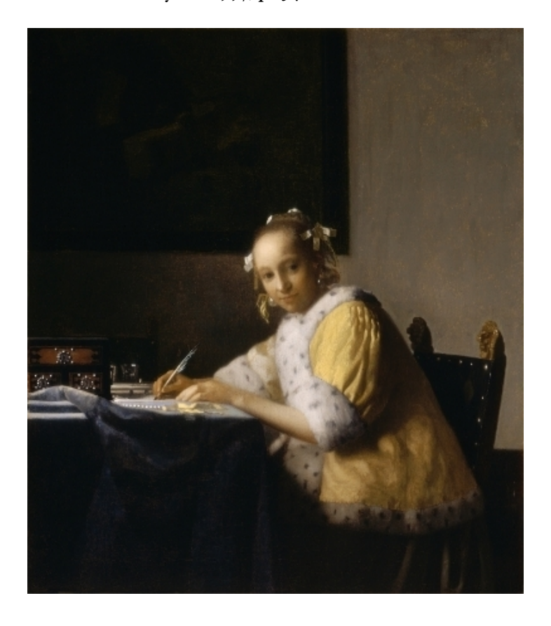
Figure 3. Johannes Vermeer: A Lady Writing a Letter (c. 1665-66), National Gallery of Art, Washington.

In only three of the twenty-six interiors that we have is the space between painter and sitter at all uninterrupted. In five of the others passage is considerably encumbered, in eight more the heavy objects interposed amount to something like a barrier and in the remaining ten they are veritable fortifications. It is hard to think that this preference tells us nothing about the painter's nature. In it the whole of his dilemma is conveyed. (1997, p. 34)