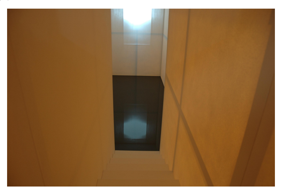
FIGURE II. Ken Wilder: Chamber (2005).

cates implicit and actual viewpoints the spectator is forced by the structure to adopt, the film image reflected in the water filled room beyond suggesting a secondary vanishing point that continues the descent of the stair.