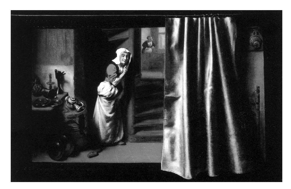
Figure 1. Nicolaes Maes: The Eavesdropper (1665), Collection of Harold Samuel, London.

wite comment upon the anecdotal content (1995, pp. 83-84). To adopt Wolfgang Kemp's terminology, the gesture forms part of the work's 'outer' rather than 'inner' apparatus, in that it is there to be interpreted by the spectator of the picture, the viewer standing before the work (1998, p. 191). We experience the maid's gesture from outside of the world the painting presents, as an audience external to the fiction. The trompe l'oeil curtain encourages and delimits our participation; it entices us to draw it open while detaching us from the fictional space. The work thus foregrounds its own fictional structure in a way that is genuinely theatrical, though one might also say that the problematizing of the spectator position in a sense becomes its content.