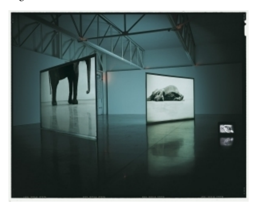
FIGURE 9. Douglas Gordon: Play Dead; Real Time (2003).

phantasmagoric potential of pre-cinema. Vito Acconci's notorious oneto-one confrontations with the filmed artist, his head tightly framed by a video monitor, might also be construed as theatrical, in that they exploit an ontological divide.)