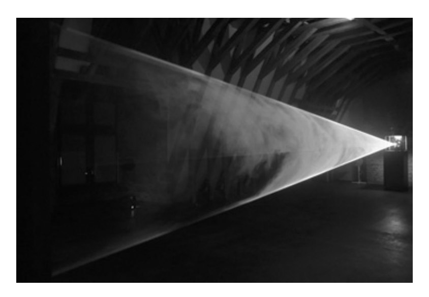
FIGURE 7. Anthony McCall: Line Describing a Cone (1973).

Fried is certainly not the only theorist to introduce the notion of video art 'opaquing' film, but what distinguishes his position is the aligning of this opaquing to antitheatrical or absorptive ends. With Gordon, he claims that distancing devices that draw attention to the situated positioning of the viewer within the gallery paradoxically refocus attention onto one aspect of the foregrounding of a film's configurational presentation, namely the acting (an aspect which forms part of what Hopkins terms the film's theatrical presentation). But is this compensatory involvement with the actors' absorption in their tasks the only gain of a foregrounding of the conditions of spectatorship?