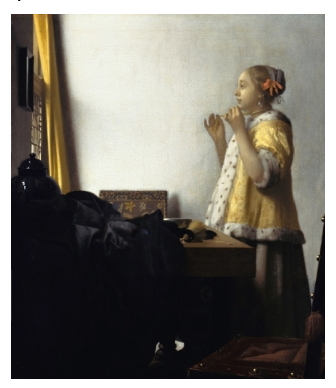
FIGURE 4. Johannes Vermeer: A Woman with a Pearl Necklace (c. 1664), Staatliche Museen Preussischer Kulturbesitz, Gemäldegalerie, Berlin.

We have already noted the 'fortification' presented by The Procuress , which despite (or, perhaps, because of) its evident theatricality seeks to limit our participation. But there is a decisive shift from the insistently 'staged' frontality of barriers used in early works such as The Procuress , A Girl Asleep (c. 1657) and A Lady Reading at the Window (c. 1657-59) (the latter which employs a trompe-l'oeil curtain), where the presence held back is still external, to the integration of furniture and objects as barriers in works such as Woman with a Lute (c. 1662-64) or Woman with a Pearl Necklace (c. 1664) [FIGURE 4] in a way that now feels entirely natural relative to a point of view internal to the scene. This arguably suggests that the beholder so persistently excluded in such absorptive works is not, as Gowing assumes, the painter, nor, indeed, Fried's antitheatrical notion of the spectator standing before the painting. Rather, Vermeer constructs barriers to a presence now potentially internal to the scene.