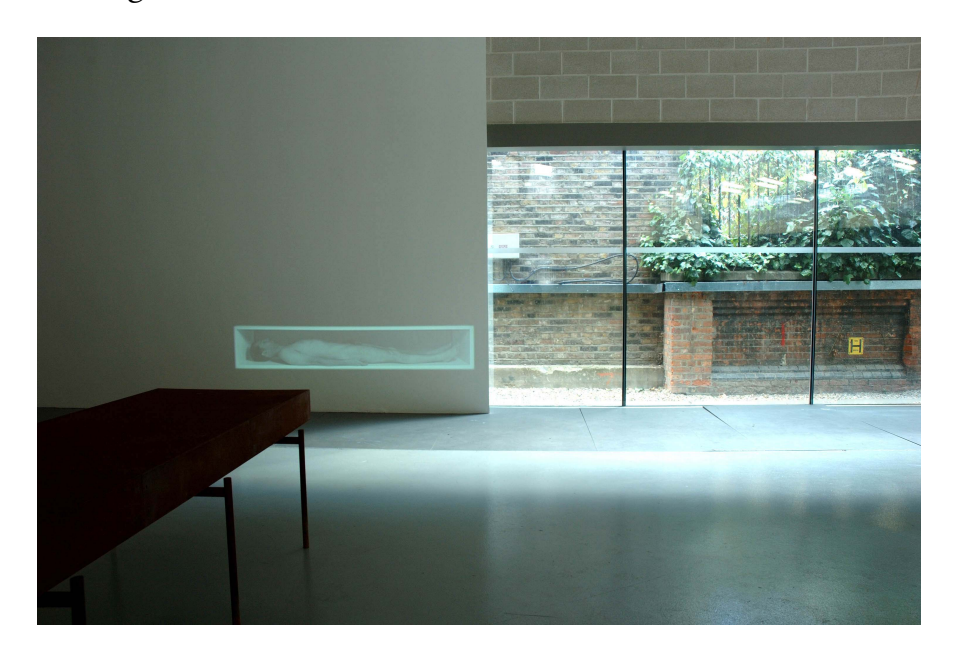
FIGURE 10. Ken Wilder: Plenum #2 (2004).

preclude, an encounter with a figural presence that problematizes the beholder position relative to the virtual space of the artwork. Whether such relations are construed as theatrical or antitheatrical, they are likewise dependent upon the fact that video art, as a hybrid form, is able to construct a particular tension between the virtual and the real. I would go as far as to suggest that any ensuing empathic projection is in fact dependent upon an artist exploiting ambiguities of 'where' this figural presence is relative to the beholder – a beholder who is both an implicit presence and external to the image.