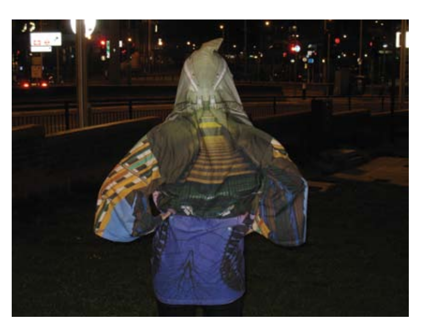
YU KA SIN Tottenham Hale Tube Station

Tottenham Hale tube station and Vibrate colours of my hall building give me a sense of belonging and interact with me everyday.