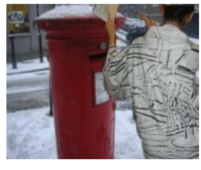
YUQIAN HUANG West Hamstead

They drew pictures of the people, the places, the buildings the animals and anything else they felt represented an important part of thir neighbourhood. The pictures were then pieced together to make one big street scene of thier community.