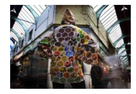
KATE WAKELING Brixton covered market

Brixton is exciting, vibrant and very culturally diverse; as a result it is often misunderstood. I wanted to portray the buzz of everyday life, which although chaotic, helps to maintain a friendly and cohesive community. The mosaic of images seen through the honeycomb pattern represents the constant hive of activity that can be witnessed any day of the week in Brixton.