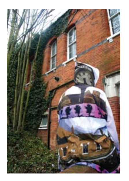
SAADIA NIAZI Purley Station, Purley

This image encapsulates the spirit of suburban Purley, with its typical English country architecture, its profusion of clocks, and its undulating, elm-lined, streets.