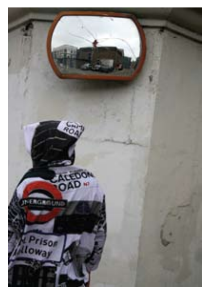
KATIE LEDGER HMP Pentonville, Caledonian Road

This image encapsulates the spirit of suburban Purley, with its typical English country architecture, its profusion of clocks, and its undulating, elm-lined, streets.