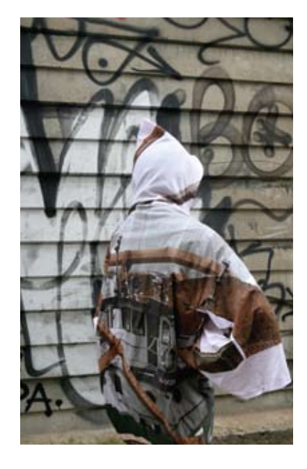
XIAOGEN SUN Canada Water

The historical connection of land and water of canada water.