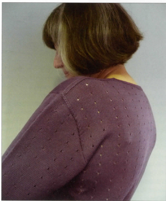
Seamless personalised sweater

with processes including rapid prototyping technologies in new ways to create personalised fit. The proposition is that personal engagement in product choices increases satisfaction so that the product will be used for longer. Eliminating processing steps along the way is a key component of the research, such as through developing seamfree constructions. A collaboration with partners from engineering design at Cambridge University and the Open University has applied process modelling software to these fashion case studies to assess the design cost and risks associated with personalised products, which are being developed to the next stage.