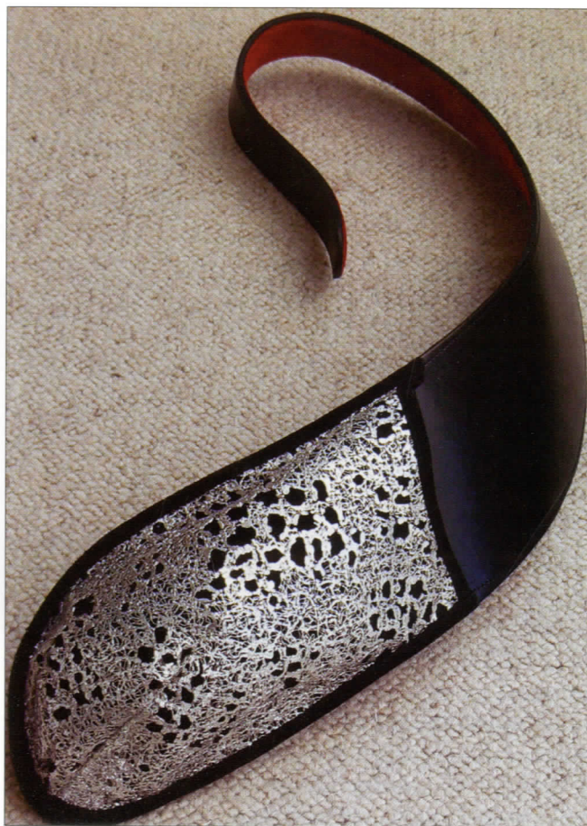
Silver Hook Bag by Steven Harkin and Frances Geesin

Catalytic Clothing is an exploratory project in development which aims to harness for the first time the massive surface area represented by our clothes, when taken together in urban environments. Given the air pollution created in cities, especially NO x , the Catalytic Clothing concept proposes to use a mass of humans working together to purify the air by wearing clothes to effectively remove noxious pollutants from the atmosphere through treated or specifically developed fabrics with nano scale functionality (such as embedded titanium dioxide). These clothes will later release the pollutants, which will be treated as part of the laundering process, using specially developed cleansers, before entering the waste water system. It has been estimated that 40 people walking across one metre of pavement could purify two metres of air space in one minute. A campaign of engagement with industry partners and funding bodies is underway, together with feasibility studies at Sheffield