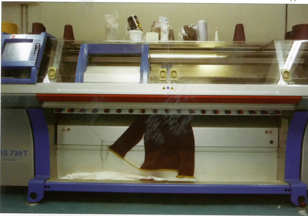
One step knitting process of seamless sweater

plastic which would decompose benignly. These were worn by fashion models poised above tanks of water, to carry the visual message around the world.