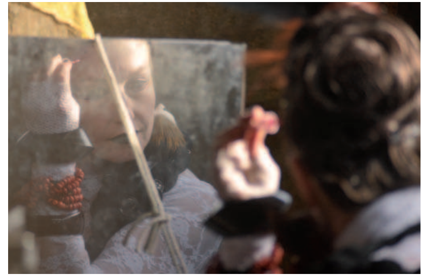
Emily Wardill, Full Firearms , 2011, video projection, c.90min. Courtesy the artist

More important to the narrative of classical melodrama than the object is the body, which figures as both the site and sign of repression and conflict. The subjects of melodrama tend to be women, and on them the plot’s conflict is visible, largely through forms of bodily aberrance (the woman is hysterical, adulterous, infirm, etc.). This is one reason why there is such an overlap between Freudian conflict and the melodramatic: ‘Psychoanalysis’, Brooks writes, ‘can be read as a systematic realisation of the melodramatic aesthetic, applied to the structure and dynamics of the mind.’ 7 The legibility of the body within melodrama is akin to its legibility within Freud’s method