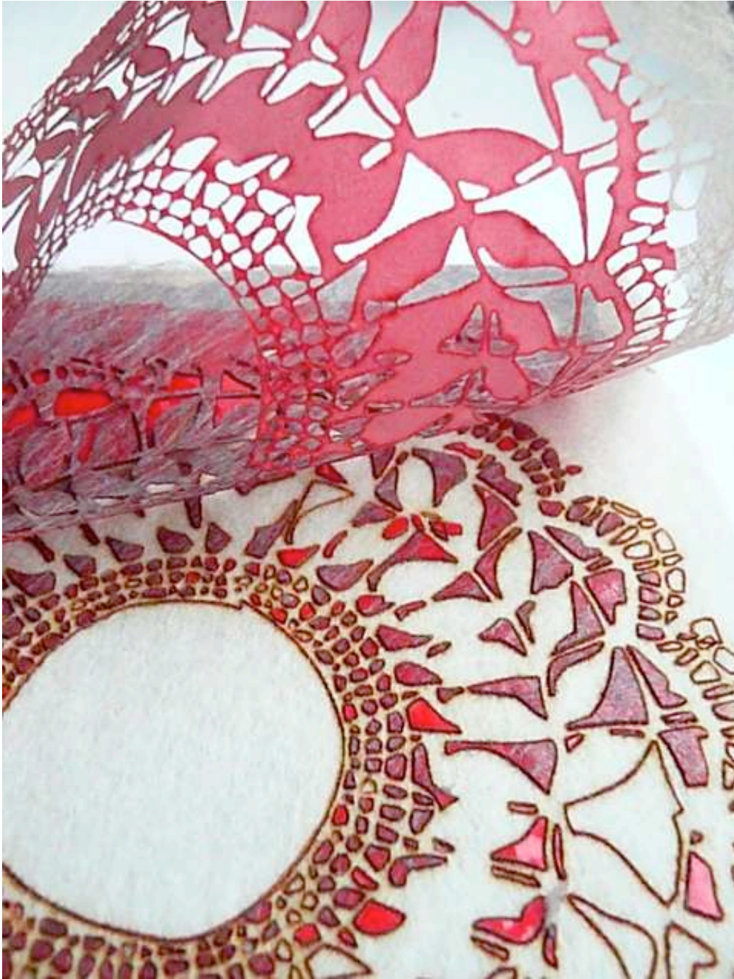
Image 2: 'ReSurfaced', by Kate Goldsworthy

Future technological developments may way provide ways for these materials to be separated back into their constituent parts and returned to their cyclic origins, but in the meanwhile strategies for extending life and creating value from waste will have an important place in preventing further landfill of valuable resources.