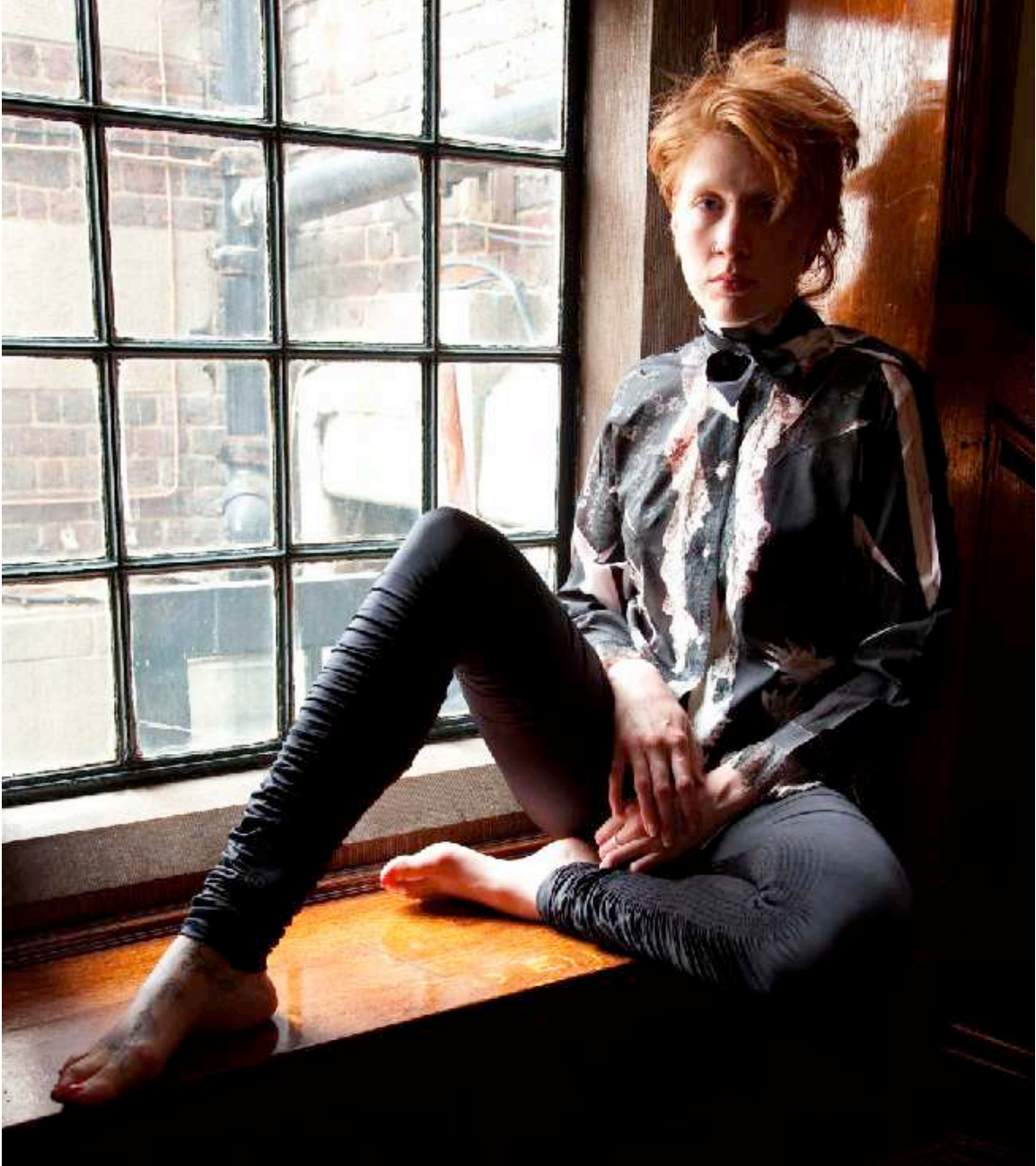
Image 5: 'Top 100: Twice Upcycled Shirt' by Rebecca Earley and Kate Goldsworthy, 2007