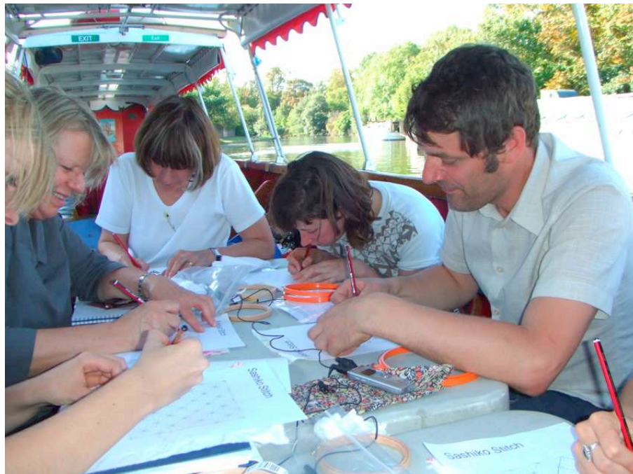
Image 4: 'Conversations', TED, London 2009