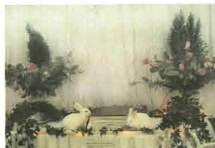
The 'WONDER' rabbits