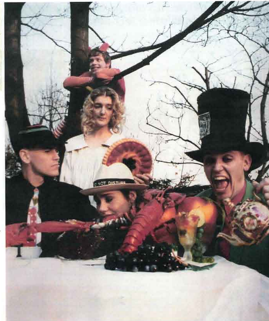
The WONDER Teaparty with CSM FCP students 1991

improved my wellbeing. Before 2003 I was 'stuck' in the sense I found it hard to manage work and mental health together.