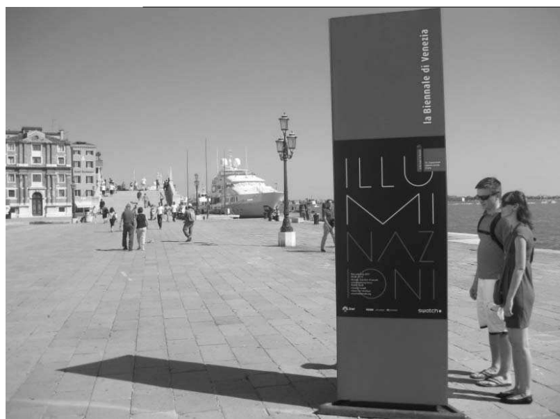
Venice, June 2011.

Tate Library, UAL, Iniva, etc., based on their individual priorities). The exchange of information and materials between UK libraries and international research centres/collections in this field (ASAC, AHWS, Documenta Archiv, AAA) should be advocated and facilitated by ARLIS/UK & Ireland and/or other appropriate bodies. Partnerships between libraries and researchers, research centres (e.g. Royal College of Art) and others active in this area (e.g. Biennial Foundation) should be explored, particularly regarding bibliographies and current and discontinued event information. Finally, private and institutional biennial archives should be identified and listed, and support structures that would allow long-term access to researchers investigated, as