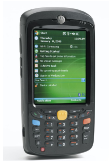
Fig. 24. Motorola MC55, Handheld computer with numeric keypad (barcode scanner on top).

north side of the room. Foam book supports were used to create packing stations of different heights to reduce the risk of back strain.