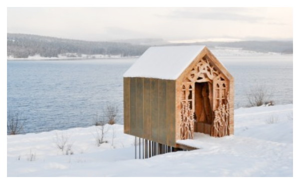
Figure 4 Freya's Cabin looking over the freezing lake

A clear example of this category is the way Studio Weave works on architectural commissions. Their project Freya and Robin [Fig 4], for example, starts as a story about two characters that lived on opposite sides of the lake for which the studio designed observation cabins. The story then becomes the guiding principle for the design of the cabins, and is used to motivate most of the design choices about the materials, forms and functions of the cabins. There are numerous examples of narrative elements being used during the design process as a creativity tool, such as Dindler and Iverson's Fictional Inquiry [9] and Nam and Kim's Design by Tangible Stories [29]. The authors argue that literary fiction can be used as a resource for design. Djajadiningrat and Gaver's Interaction Relabelling [10] shows how in a design assignment unrelated products (e.g., a toy revolver) can open up new space for creativity by bring a different story to the table.