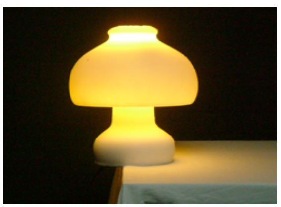
Figure 6. The On-Edge Lamp by Silvia Grimaldi

series) [Fig 6] is meant to discover certain surprising findings in a particular sequence to increase the memorability of the object: the designer intended the lamp, which references the form and material of glass lamps, to sit on the edge of the table, so as to appear in a position of danger and activate a gut reaction in the viewer to want to move it onto the table. This has two effects — when the lamp is fully on the table it shuts itself off, revealing that it is meant to be on the edge, and also by touching the lamp the user realises that it is made of rubber, not glass, and is hence not as delicate as it appeared [20].