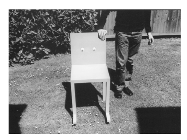
Figure 2 - Nipple Chair by Tony Dunne and Fiona Raby

witch's broom, according to the story she wishes to envision [33]. The stick lends itself to this play because it is reminiscent of these other objects in shape, but ambiguous enough to leaves space for the imagination. But the category is not restricted to child's play. For example, Tony Dunne and Fiona Raby's Nipple Chair [Fig 2] is designed to trigger story creation in the user through intriguing but ambiguous output. The chair features two 'nipples' that seem to vibrate at random times. Because the user is unaware of exactly what electromagnetic event turns the vibration on and off, he or she is likely to attribute some sort of causal narrative to the chair's erratic behaviour.