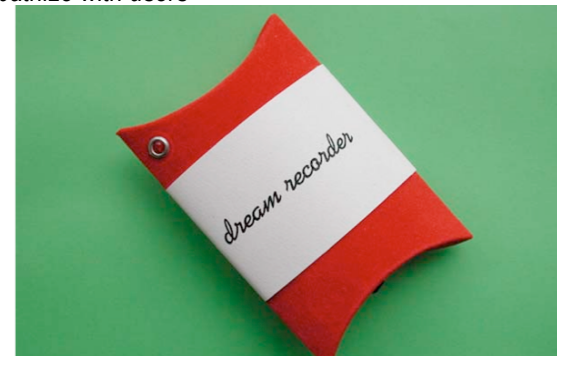
Figure 3 Bill Gaver, "Dream Recorder", Cultural Probes, 2004

Category 2.1: Narratives as tool to understand and empathize with users