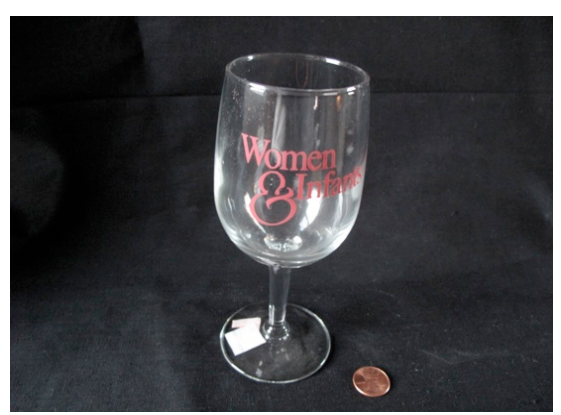
Figure 5. Glass that increased in price 200-fold with an accompanying story

story. The recent project Significant Objects [17] aimed to measure the added value that an accompanying story adds to an object. Cheap objects were purchased at flea markets and writers were asked to write an accompanying story. The objects were then sold on eBay with the attached story to verify the increase in value. For example, a glass that was bought for $0.50 was subsequently sold for $50 [Fig 5] The buyers were not purchasing the story, freely available online, but simply the object which acquired meaning through the story.