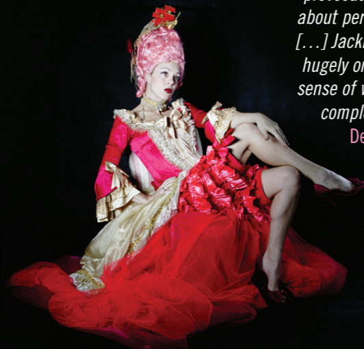
Cover design: BRILL

Debra Ferreday, author of Online Beginnings