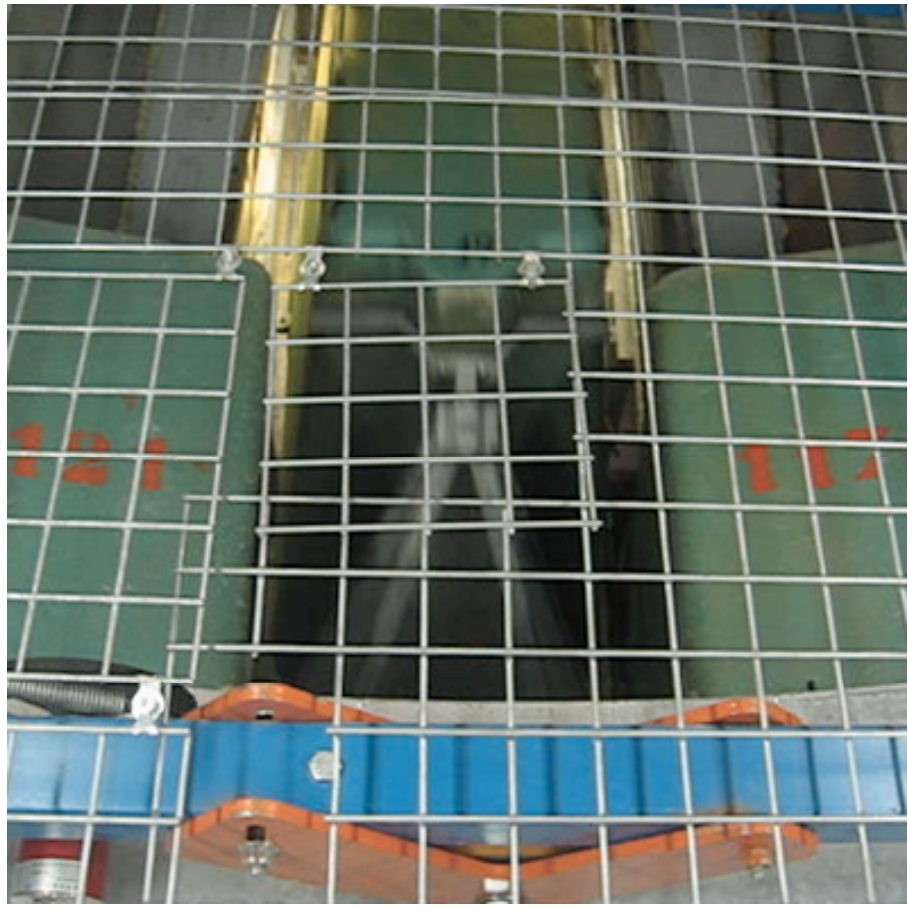
Figure 6. b