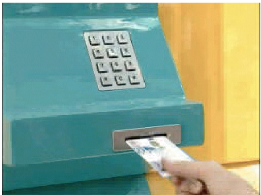
Figure 7. © Biceberg