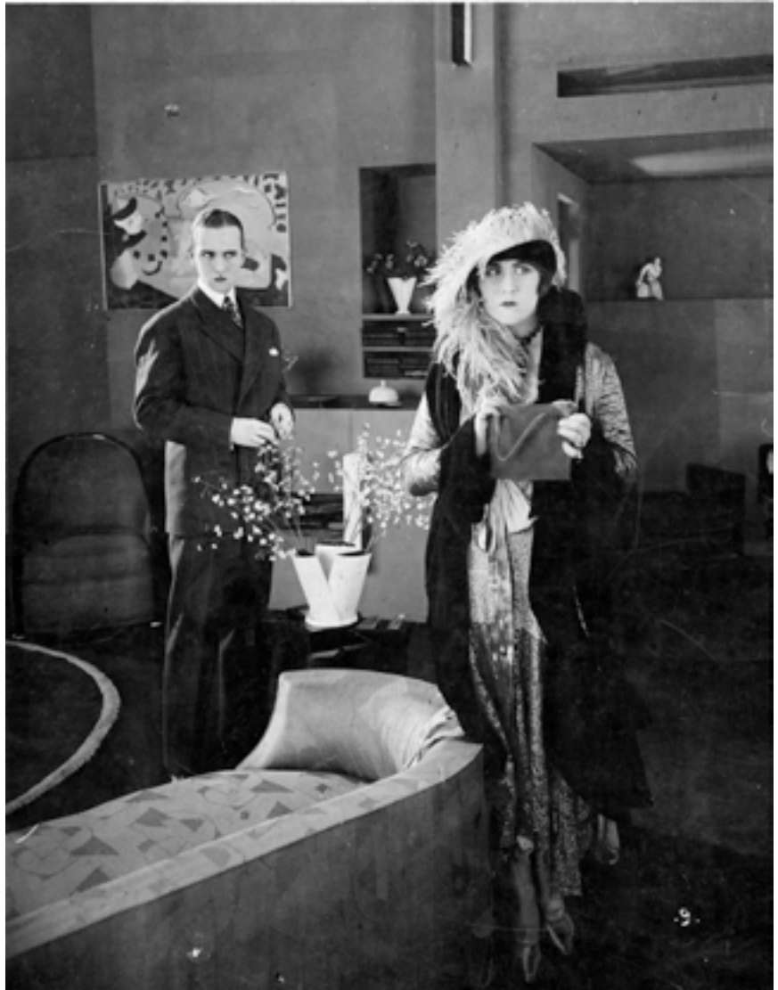
Jaque Catelain and Emmy Lynn in Le Vertige, Marcel L'Herbier, 1926. Set design by Robert Mallet-Stevens. Set dressing by Jacques Manuel.

modernes , Delaunay used simple geometric shapes to convey colour, time and rhythm. Something L'Herbier's film cannot capture, evidently, is the complex interrelationship between form, shape and colour. In a lecture delivered at the Sorbonne in 1927 on the influence of painting on fashion design, Delaunay located the value of geometric forms not simply for their graphic simplicity, but also for their ability to distribute colour. 13 Robert and Sonia Delaunay were both at the vanguard of the emerging technological interest in colour that would radically affect the visual arts. Le Vertige is intriguing for how the use of fashion and costume (most notably the striking 'simultaneous' dressing gown) encourages the viewer to replace colour with geometric motif and shape, to re-place colour within the frame.