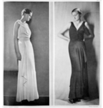
Chanel evening dresses, Femina , November 1932.

You have to create a special fashion for film, or at least interpret current fashion without losing the plot. This way you avoid two snags: creating 'costume', which would be too easy, or seeing clothes go rapidly out of fashion. (The) American film stars seem to feel they lack guidance. The fabulous sums they spend and the complete freedom they are allowed have led to a kind of clothing anarchy or fatigue, which they would like to leave behind. I work hard to try to create a film style. On the other hand, fashion can be promoted by the cinema nowadays. Up to now, film has been content to follow fashion – not the fault of the actors but the directors; they've paid too little attention to the question of costume or else used second or third rate fashion houses.