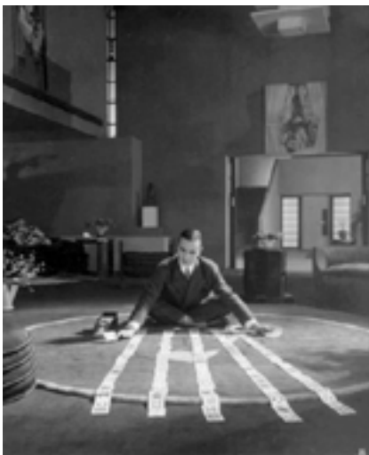
Jaque Catelain in Le Vertige, Marcel L'Herbier, 1926. Set by Robert Mallet-Stevens, sofa and chair by Pierre Chareau, paintings by Jean Lurçat (left) and Robert Delaunay (right). Carpet by Jean Lurçat. Cushions by Sonia Delaunay.