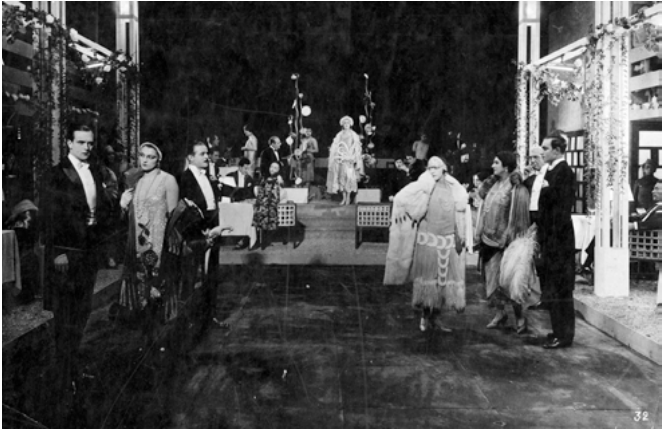
A set from Le Vertige, Marcel L'Herbier, 1926. Decor featuring chairs by Paul Poiret's workshop Martine.