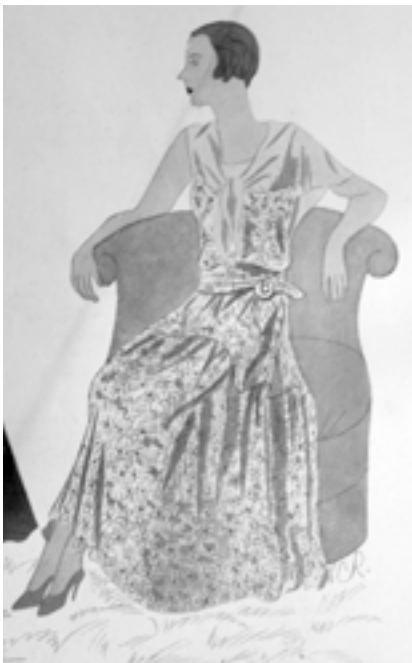
Day dress by Louiseboulanger, Femina , February 1930.