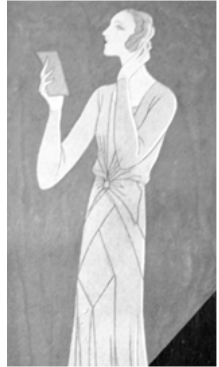
Lucien Lelong, Femina , January 1930.