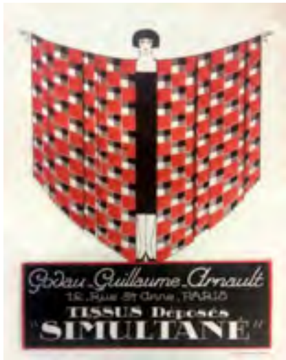
Advertisement for 'Simultaneous' fabrics. L'Officiel de la couture , 1924. Courtesy Central Saint Martins Museum & Study Collection.

Le P'tit Parigot (both 1926). 4 Although these black and white films could not reproduce the vibrant colour contrasts of simultaneous art, the Delaunays' work was clearly considered important in conveying a kind of deco 'moderne'. Simultaneity enhanced the filmic narrative's depiction of an affluent, modern milieu, social encounters revolving around sporting activities, motoring, parties and dancing.