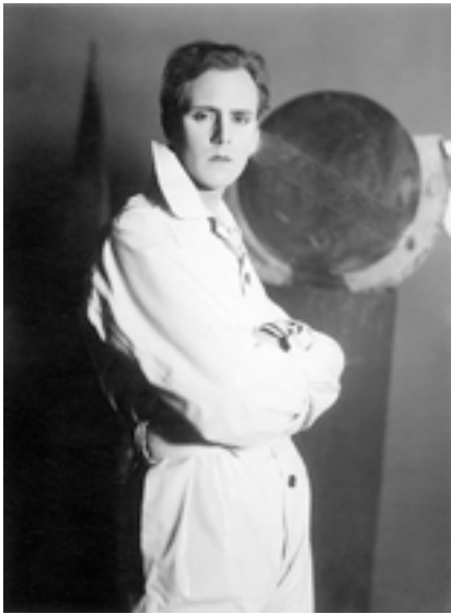
Jaque Catelain in L'Inhumaine , Marcel L'Herbier, 1924.

a rejection of the prevailing 'cult of strength'. For Véray the film is a studied rumination on the meaning of manliness and its co-option by the destructive forces of war. 13 In this instance, then, it is possible that – if only in L'Herbier's imagination – the ephebic male can channel a subversive cultural critique of conventional war narratives.