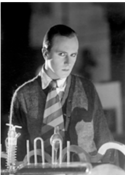
Jaque Catelain in L'Inhumaine , Marcel L'Herbier, 1924.

To look at L'Herbier's work through the prism of art and design is to draw attention to the filmmaker's status not only as a significant figure of French cinema but also as a hitherto unrecognised force in French modernism. Motivated above all by his pursuit of 'photogenic' and 'total' cinema, 2 L'Herbier assembled a truly