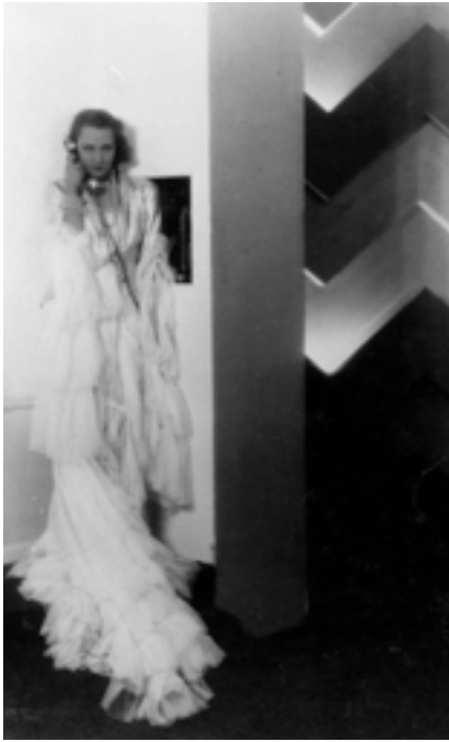
Brigitte Helm in L'Argent , Marcel L'Herbier, 1928. Costume by Jacques Manuel. Chevron light panel designed by Jaque Catelain.