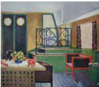
Atelier Martine interior display in the Paris 1925 Exposition internationale des arts décoratifs, showing furniture similar to that used in Le Vertige . From Léon Deshairs, Intérieurs en couleurs France , 1925.

modernity, situating both in the wider context of early twentieth-century modernism, with reference to the Delaunays and to the architect Robert Mallet-Stevens, whose contributions to Le Vertige gave it its distinctive aesthetic.