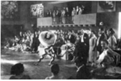
Dancer Lizica Codreano performing in Le P'tit Parigot , René Le Somptier, 1926.