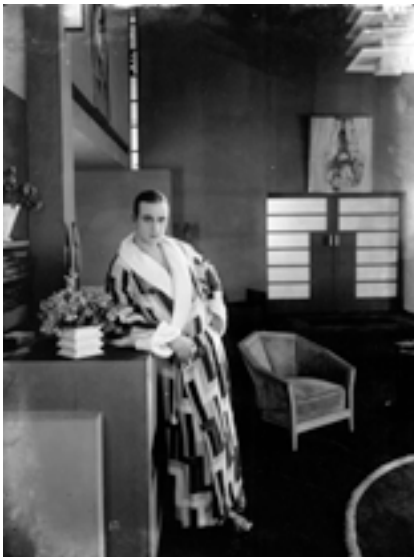
Jaque Catelain in a publicity photograph for Le Vertige , Marcel L'Herbier, 1926, showing Catelain posing in a dressing gown made from simultaneous fabric by Sonia Delaunay. Robert Delaunay's painting of the Eiffel Tower hangs on the wall above the double door, chair by Pierre Chareau.

The film's allusive English title The Living Image (it was also released in the U.S. in 1928 under the more functional title of The Lady of Petrograd ) foregrounds L'Herbier's articulation of style and decoration in conjunction with fantasy and desire. The title also refers to Catelain's dual role as the reincarnation of Natacha's former lover, whose uncanny return to haunt her is set in the glamorous city of Nice. Le Vertige documents the emergence of the French Riviera in the early