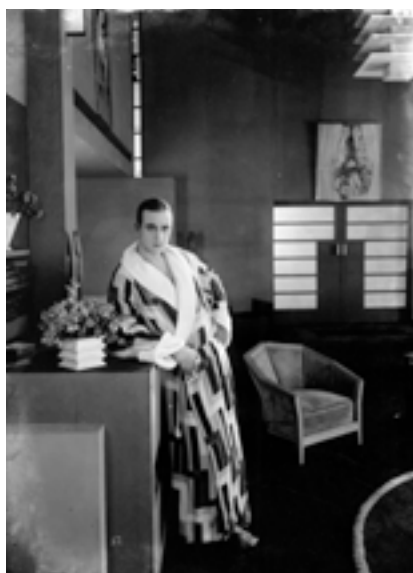
Jaque Catelain posing in a Sonia Delaunay dressing gown for Le Vertige , Marcel L'Herbier, 1926.