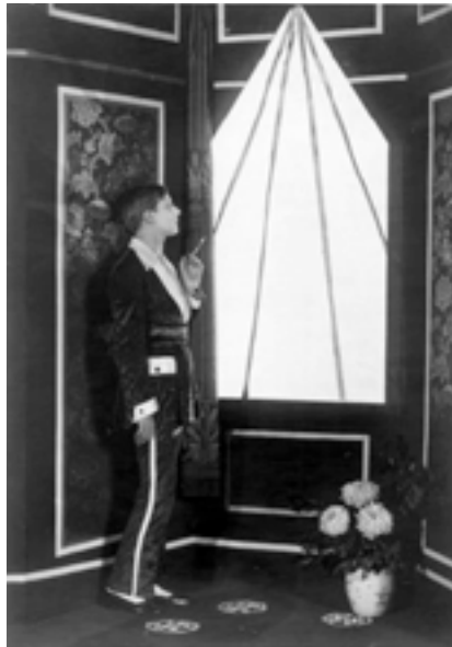
Jaque Catelain in Rose-France, Marcel L'Herbier, 1918.