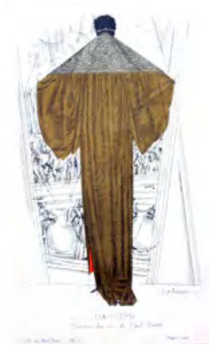
Paul Poiret evening coat, Gazette du Bon Ton, no2, March 1920