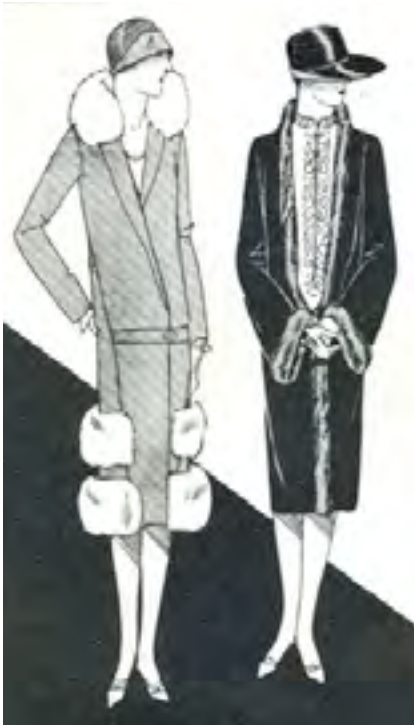
Drecolli, Chiffons , 20 June 1926.