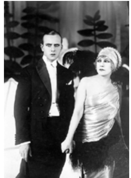
Jaque Catelain and Georgette Leblanc in L'Inhumaine, Marcel L'Herbier, 1924. Leblanc's dress was by designed Paul Poiret.

a cultural valorisation of muscles, which led to a conflation between muscularity and patriotism. In a very generalised way, then, the ephèbe was letting the side down. 9