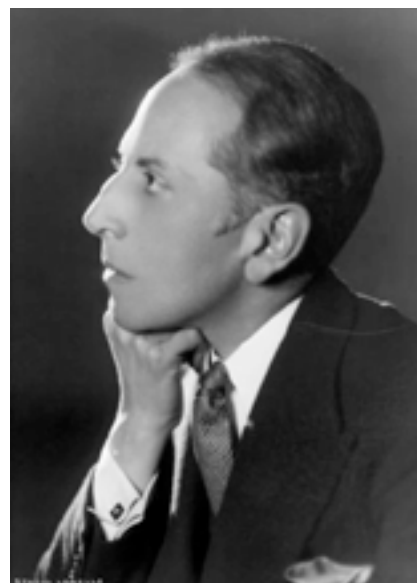
Marcel L'Herbier, studio portrait.

With the foundation of his own film production company, Cinégraphic, in 1922, L'Herbier created a platform for realising his own cinematographic projects, as well as those of other young filmmakers, including his close collaborators Claude Autant-Lara and Jaque Catelain. His next films Juan and Faust (1922), L'Inhumaine ( The Inhuman Woman , 1923) and Le Vertige ( The Living Image , 1926) constitute a bold showcase of some of the most important formal manifestations in French modernist art, design and architecture. It was in this period that L'Herbier firmly