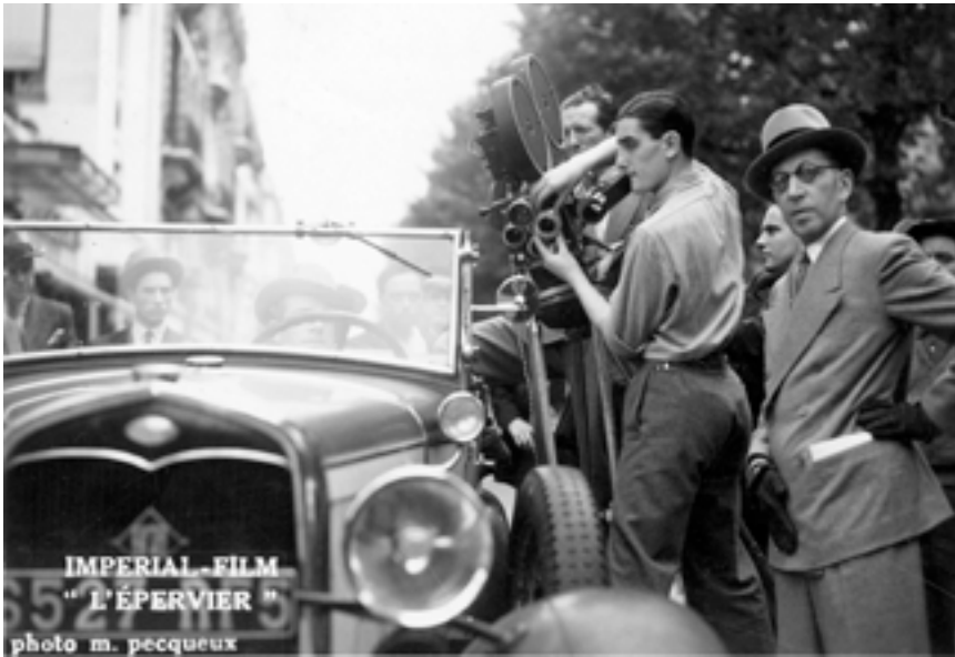
Marcel L'Herbier (far right of photo) during the filming of L'Épervier (The Sparrowhawk) 1933.

established himself as an important figure of the cinematic avant-garde, not least because of his ambitious plan to make cinema into a synthesis of contemporary visual arts and music. L'Herbier's last silent film, L'Argent (Money, 1928), was made – somewhat ironically – after the arrival of sound. The audacious adaptation of Emile Zola's 1890 novel of the same name has been praised for its ambitious use of space, the virtuosity of its mises-en-scène, its rhythmic camera movements and the complexity of its characters.