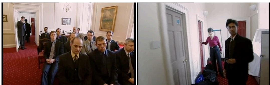
Figure 3. Above left, an army minder in the doorway signals the film crew to leave. Above right, director and producer caught in shot with recording kit.

One of the Family? reveals some army attempts to control the filming process by leaving minders visible when they strayed into shot. Playing Model Soldiers included footage of a reflexive moment of the filming team, see screenshots below and also discussed in 2.2. Access in observational documentary is not necessarily granted for the whole of an event and typically scenes cut from what we were allowed to record, to the next scene. However at a Horseguards' seminar on race, Rughani instructed the cameraman to keep filming the process of being removed and included hand-held footage of this. The moment is described in commentary as army discussions being kept 'strictly under wraps'. The team is glimpsed being removed from the seminar, drawing attention to three elements: the filmic construction of the scene, the mediated access to the event and the fact that we were only allowed to observe part of this conversation. This kind of transparency emphasises the dimension of production ethics on screen. Integrating such shots goes against the conventions of Direct Cinema, Free Cinema or the main swathe of television documentary directing where continuity and naturalism (Hall 1975, Williams 1977) dictate that shots are edited into sequences that flow without drawing attention to their construction.