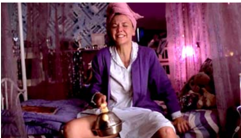
Figure 2 - Scene from Secretary (Shainberg, 2002)

This project is being piloted with the kettle. The films selected for this pilot were Vera Drake (Leigh, 2004) a historical drama in which the kettle helps establish the character of Vera as a caring individual, and helps to frame her activity of providing illegal abortions as a caring act; Wristcutters: A Love Story (Dukic, 2007) a comedy in which the kettle's whistle is used as a device to cut from one scene to another; A Tale of Two Sisters (Kim, 2003) a psychological horror in which a boiling kettle is used as a weapon; and Secretary (Shainberg, 2002) a comedy/drama/romance in which the kettle is used to establish a domestic calm scene but in that same scene is then used as a masochist's tool.