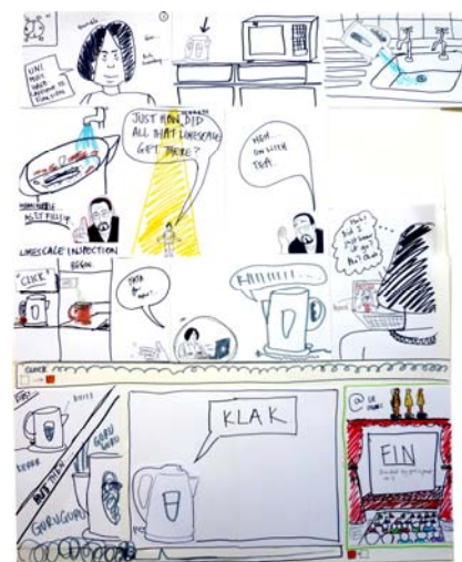
Figure 3 - sample storyboard of kettle use

The final step in the participant involvement was to create a storyboard of their use of the kettle, and to answer a few final questions about whether they enjoyed the storyboard exercise. Because the participants were not necessarily familiar with drawing or with storyboard techniques they were provided with cut outs of faces, bodies, hands and kettles at different sizes and scales which they could collage into the storyboard. An example is shown in Figure 3.