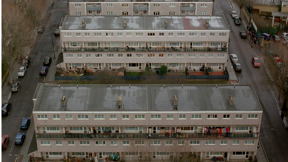
29.01.10 Aberfeldy Estate, Poplar, London E14.