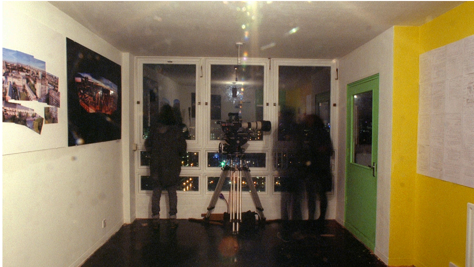
22.01.10 Opening scene of About Now MMX . People attend the private view of exhibition to conclude the 4 month artist's residency in Balfron Tower.