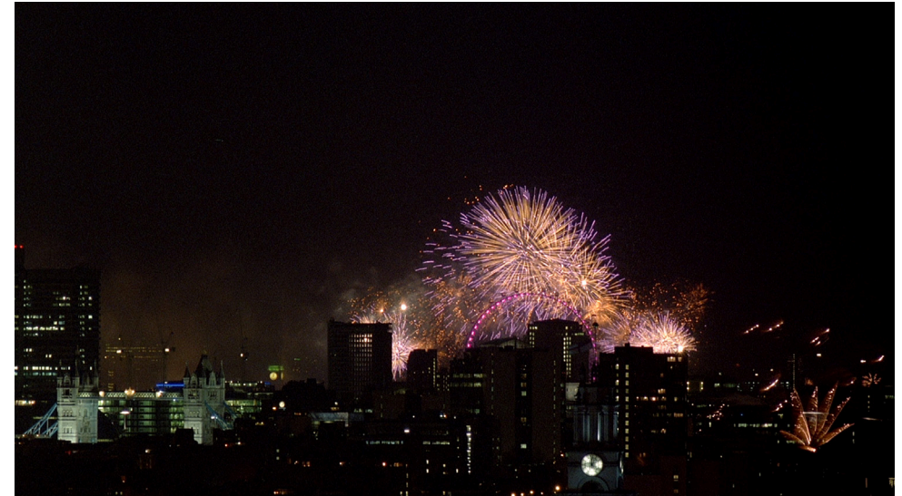
01.01.10 Midnight fireworks New Year's eve 2010.

WR You talked about slowing sound down in About Now MMX as a contrast to the speeded up image and one of the things we haven't talked about is that you chose to run the sound backwards at certain times.