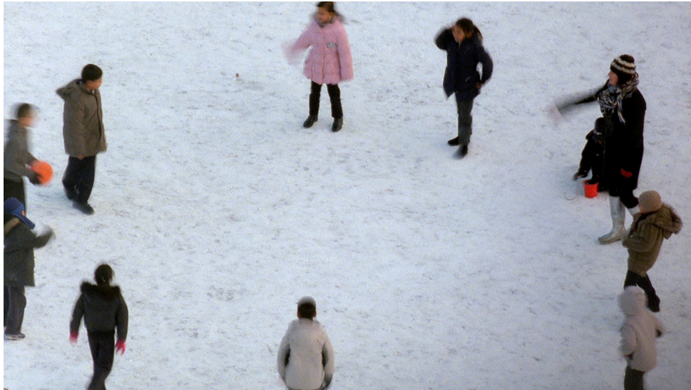
08.01.10 Children with teacher in Culloden School playground.