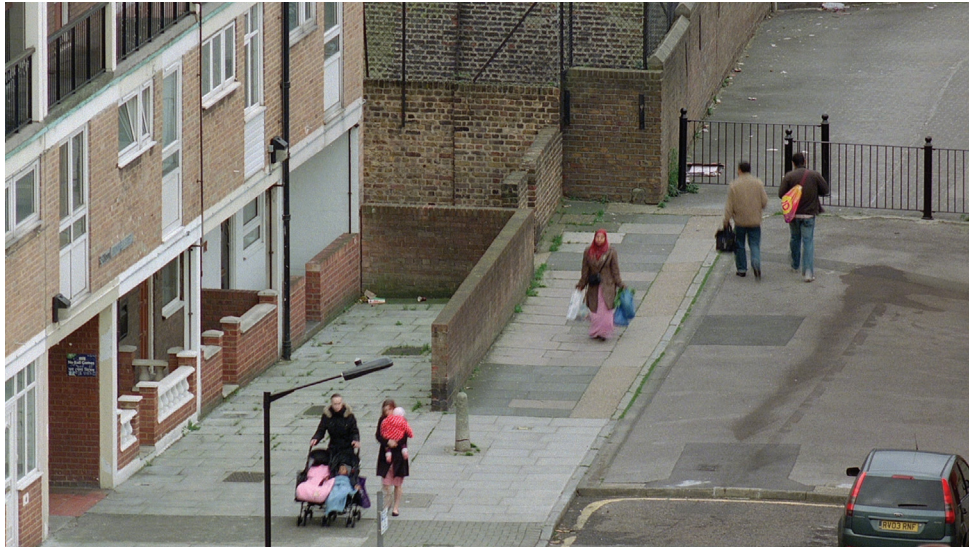
19.11.09 Brownfield Street, London E14. The 500mm lens telephoto condenses space so that it appears that perspective is reversed with the vanishing point not on the horizon but behind the camera.

David Cunningham's percussive soundtrack.