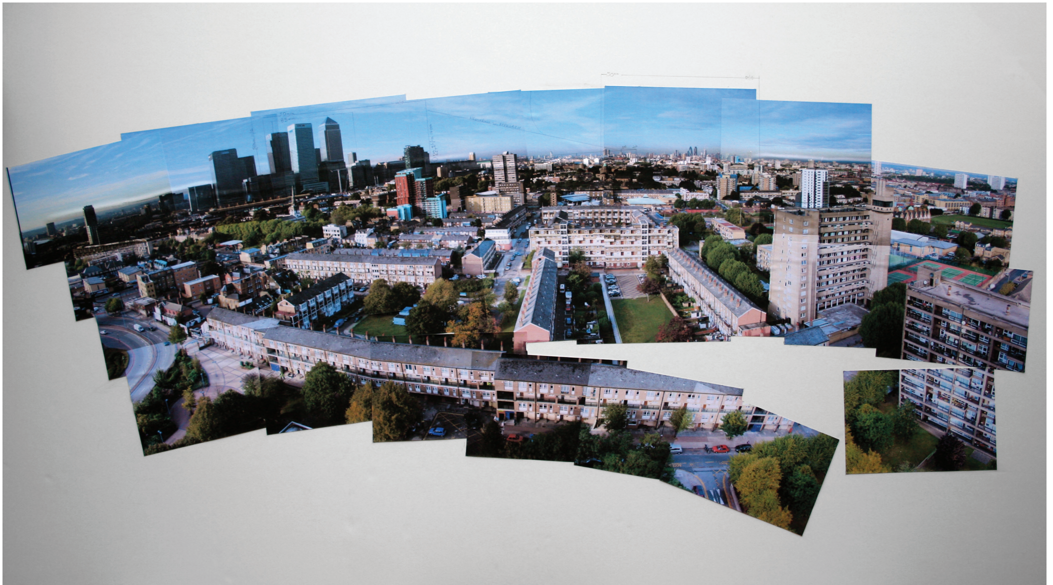
Photo collage westward panorama (155 × 110 cm) used to calculate lens focal lengths required to achieve particular framings and for the planning of camera movements. Filming in fog or at night, some key architectural features within the frame were invisible. In these situations, the maps enabled the time-lapsed camera movements to be navigated with precision