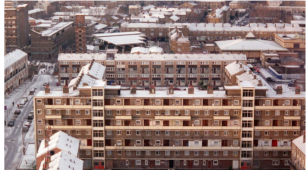
07.01.10 Brownfield estate, Poplar, London E14 with Christ Church Market in the background.

Cunningham's gallery installations have been exhibited at Tate Britain, Biennale of Sydney, ICC Tokyo and Ikon Birmingham. These installation works magnify the sound of a room, a music delineated by the architectural characteristics of the space.