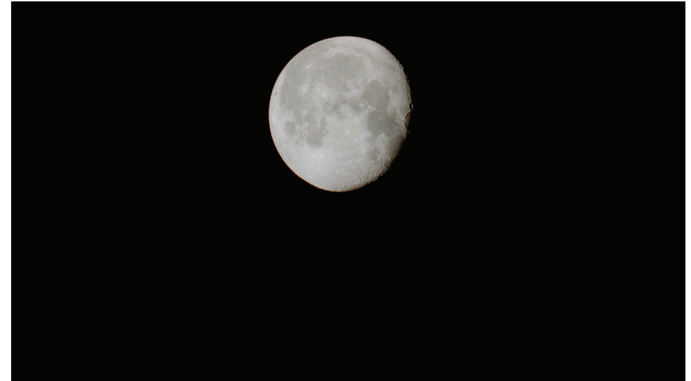
03.01.10 Waning Moon descent.

DC Though in a sense, if you address time, you address pitch hence you address pitch and the soundtrack of About Now MMX , that re pitching thing becomes quite relevant in a way. Though what the viewer sees or hears it is not that clear because there is an awful lot going on both sonically and in terms of the picture.