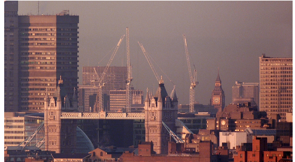
10.12.09 Tower Bridge with Big Ben in the background. The 500mm lens compresses the space between these two London landmarks.

DC Really we are talking about a whole territory here (you may hate my description) which is 'post structural'. It is taking the ideas, the vocabulary of structural film and moving it a level further. It is applied rather than pure. I think of Philip Glass's music as a good example of what happened. Glass started out doing very pure systems pieces and just took that vocabulary and started writing operas over the top of his original process work. The self-referential nature of that vocabulary was kind of left behind though you haven't abandoned that – not so completely and to some extent neither have I. I always get worried with your work, when I am working on your stuff. Am I decorating it? I am not illustrating but I am perhaps decorating or prettifying.