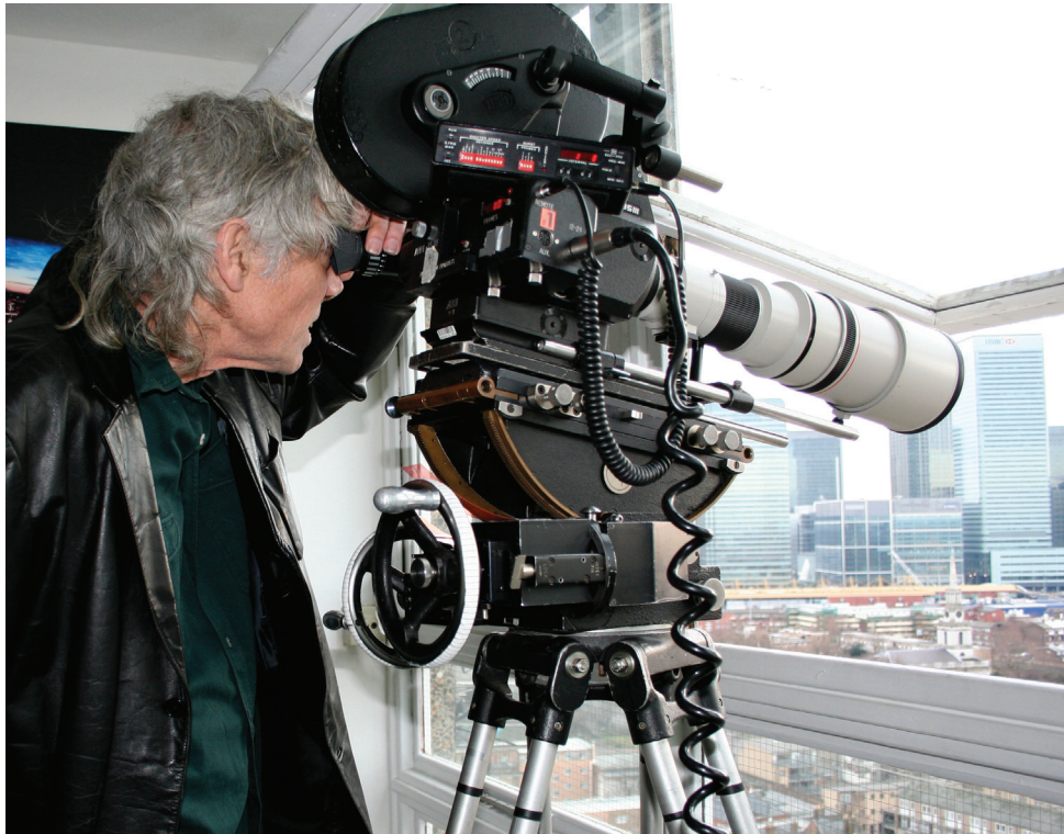
Arriflex 3 35mm camera with time-lapse motor and 500mm lens mounted on Moy geared head in position at Flat 123, Balfron Tower, London E14