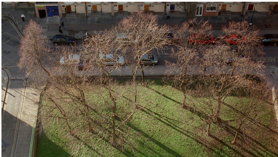
30.01.10 Balfour Tower forecourt on St Leonard's Road, Poplar, London E14.