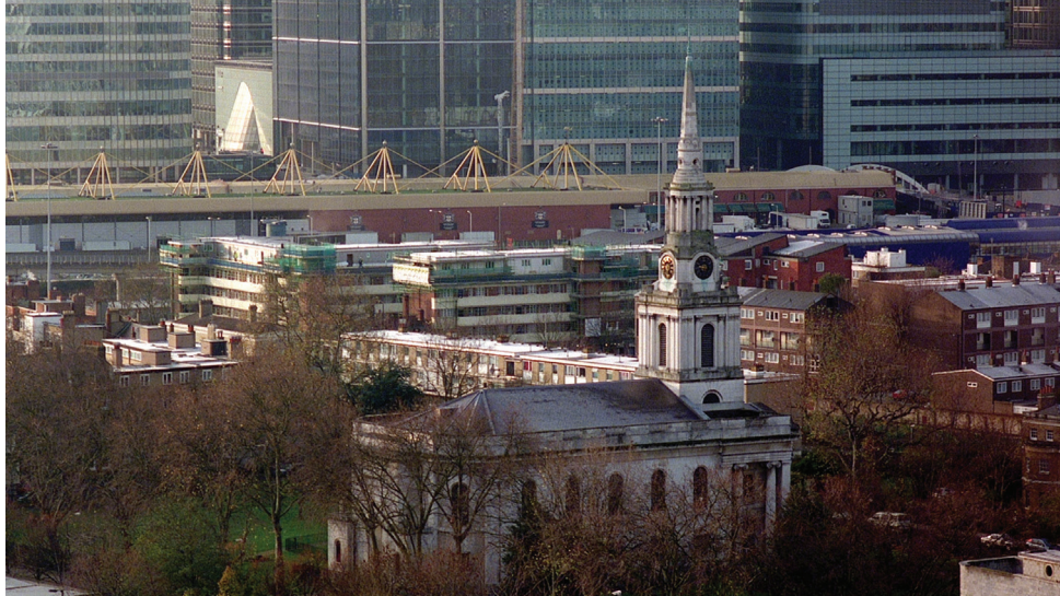
01.12.09 All Saints Church, Poplar, London E14 against the backdrop of the Canary Wharf complex.

From the back of the flat in the immediate foreground, is the northern approach to the Blackwall Tunnel. Bow Creek's tidal waters flow through banks of reeds in the middle foreground and planes take off from London City Airport away to the southeast. These different areas are interconnected with each other by means of the time-lapsed camera movements. I wanted to reveal the stark contrasts in the view of this cityscape as can be seen in the series of tilts down from tightly framed shots of the Gherkin in the city of London to the social housing on the Brownfield estate in the immediate foreground. Within a matter of a few short seconds, one of the wealthiest areas of Europe within the 'golden mile' is set in stark contrast with one of the most impoverished.