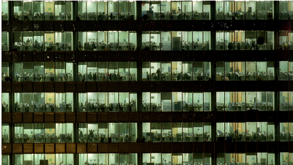
29.01.10 Office workers at Barclays Bank, Canary Wharf, 1 Churchill Place, London E14.

between individual photograms as they move through the projector at twenty-four frames per second. Ordinarily, this cinematic flow of time passes with the differences between frames effaced in a smooth continuum. Raban's approach foregrounds the illusory flow, with the repeatable logic of the machine interjected by mark-making linear movements of the camera, and the material surface and rectilinear shapes of the images fractured into subtle interplays of form.