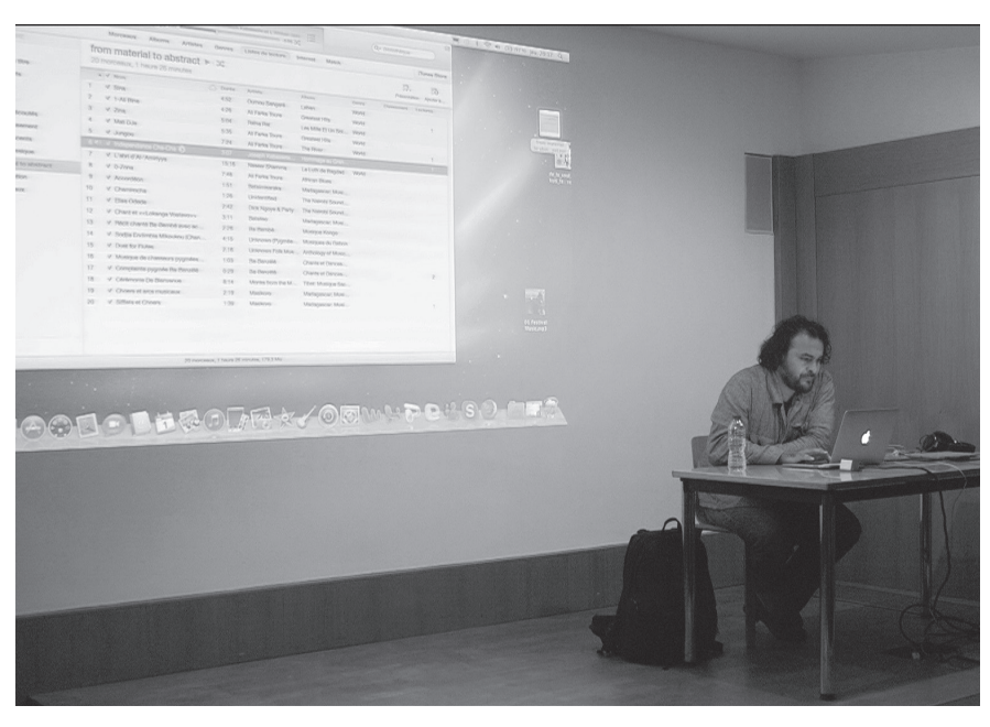
der Attia, Lecture-performance, 1 May 2014, Whitechapel Gandon.