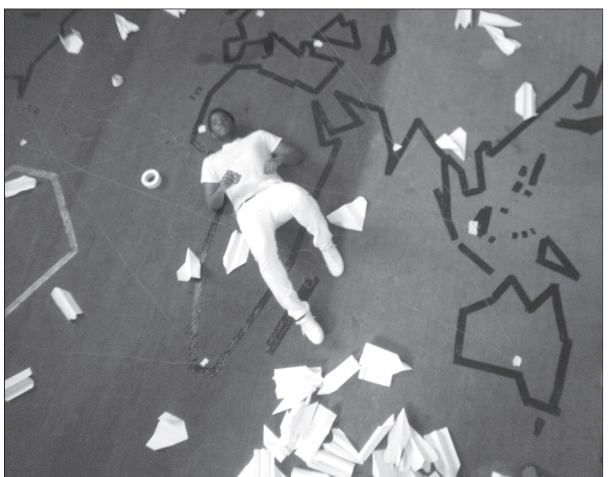
Quinsy Gario, 'A Village Called Gario', 2014