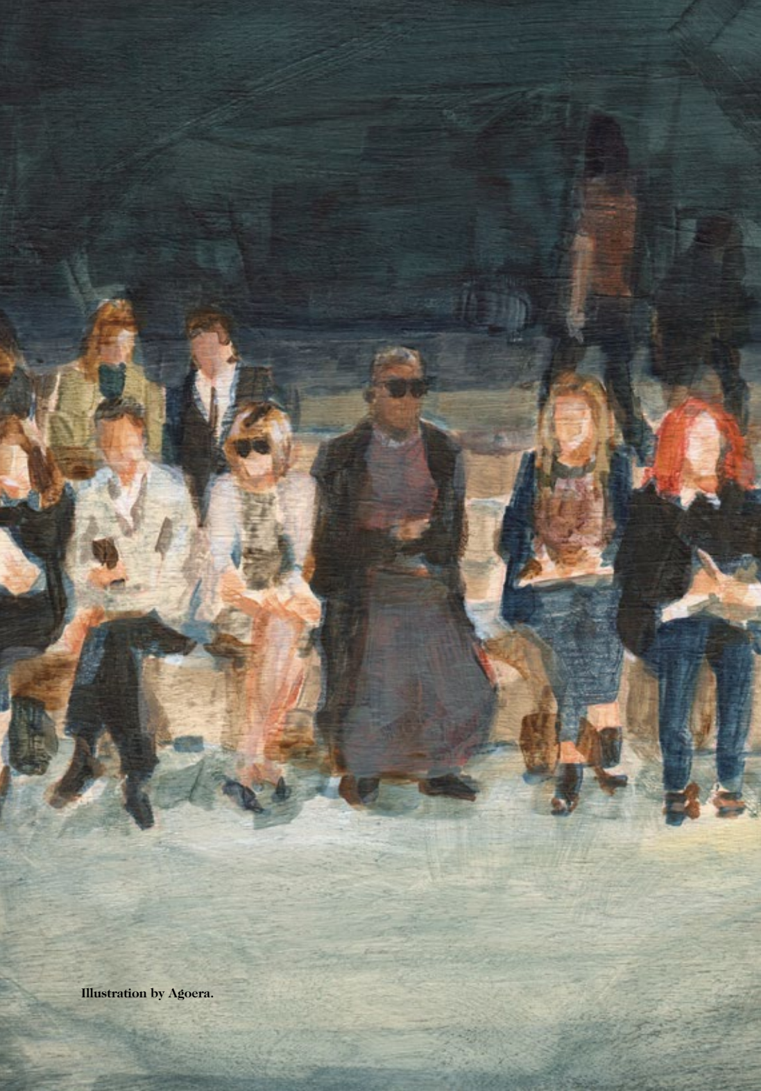
Illustration by Agoera.