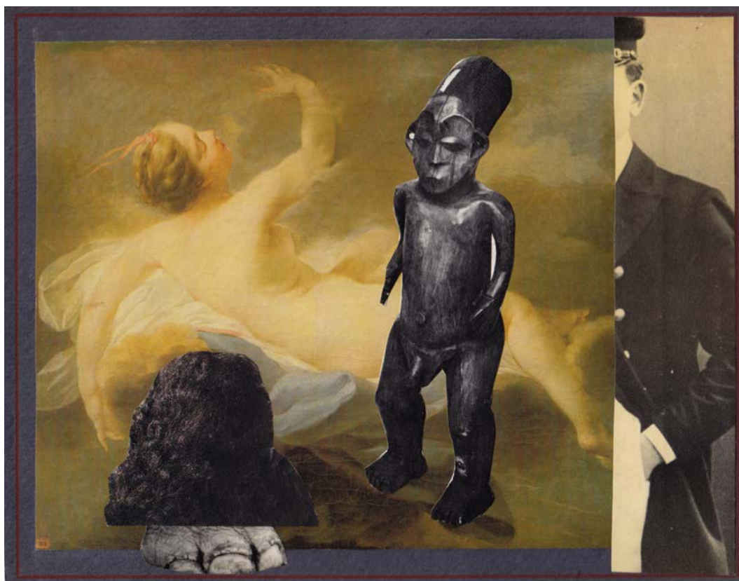
1.4 Maud Sulter, Malheureusement: Malheureusement, parce que tu parlais d'anges [Unfortunately: Unfortunately, because you spoke of angels], from Syrças , 1993. Colour photographic print, 101.6 x 152.4 cm, The Estate of Maud Sulter.