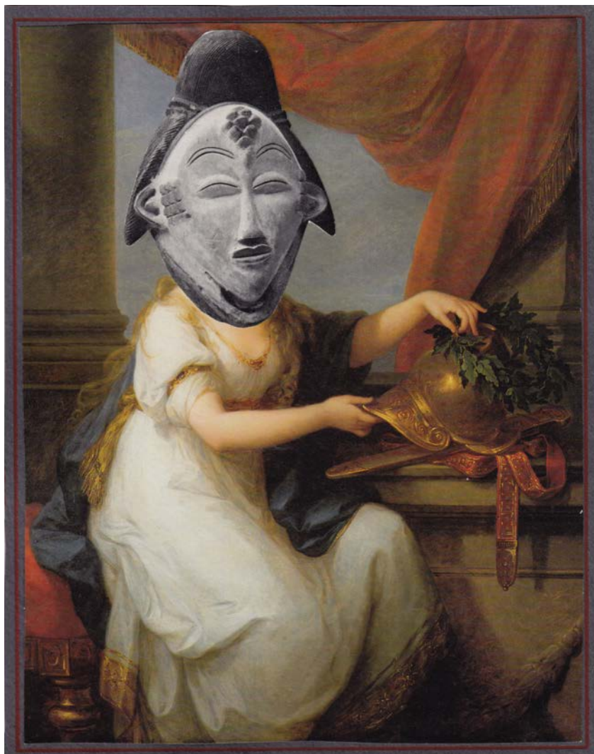
1.2 Maud Sulter, Duval et Dumas: Duval , from Sycas , 1993. Colour photographic print, 101.6 x 152.4 cm, The Estate of Maud Sulter.