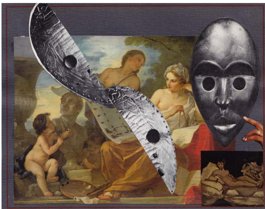
1.5 Maud Sulter, Malheureusement: Malheureusement, comme d'habitude je comparais la couleur de mon rouge à lèvres et celle de mon foulard... [Unfortunately: Unfortunately, as usual I compared the colour of my lipstick to that of my scarf...], from Syrças , 1993. Colour photographic print, 101.6 x 152.4 cm, The Estate of Maud Sulter.