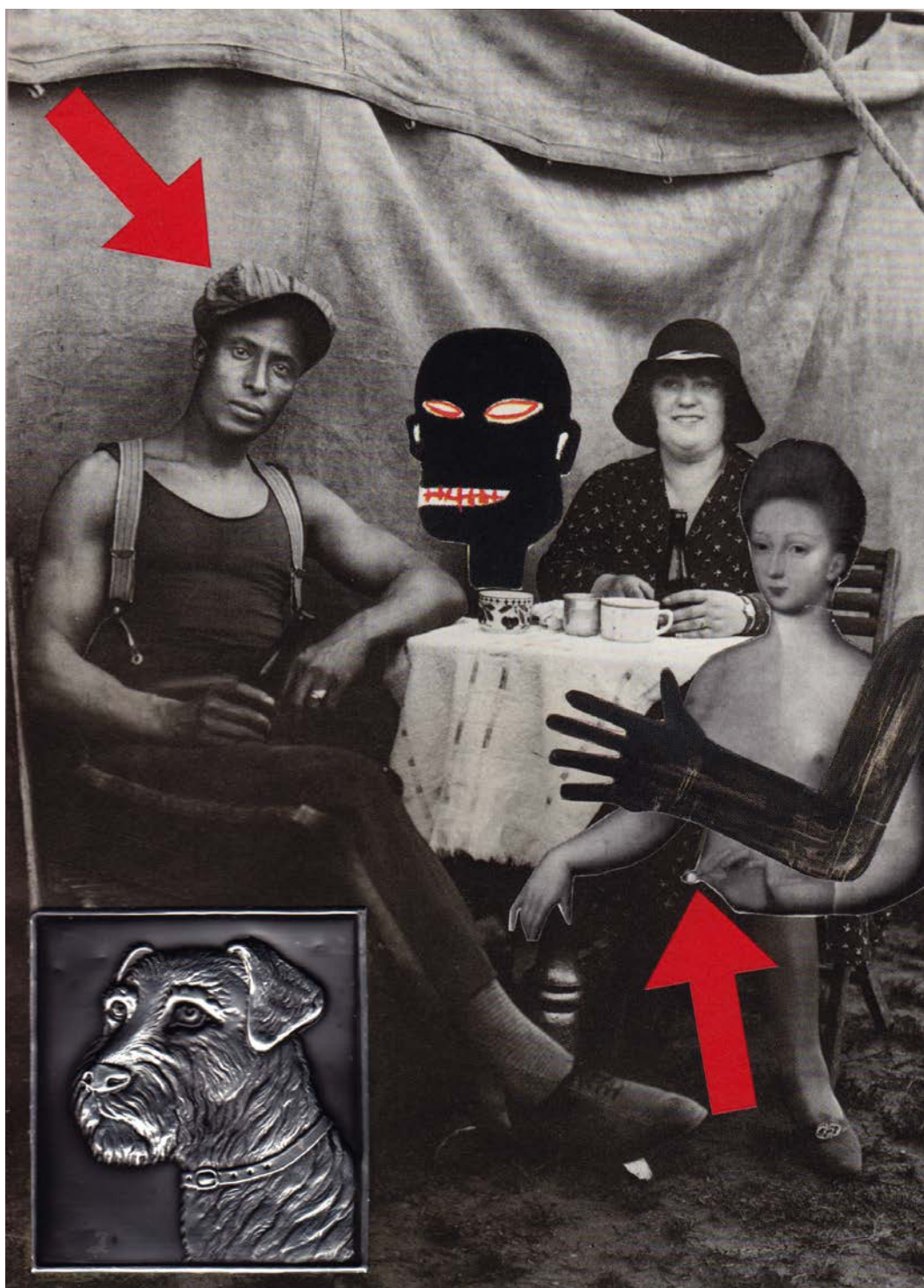
1.6. Maud Sulter, Untitled , 1993. Photomontage on paper, 18.5 x 13.2 cm. Reproduced on the back cover of Syracas: Maud Sulter , 1994, The Estate of Maud Sulter.

sortir avec ma femme from the Voyager set, where a long black arm and hand reach out to grasp a white marble (neo-)classical bust. A hand and arm and arrows cut across and into the photomontage reproduced on the back cover of the catalogue, its inserted images juxtaposing the courtly beauties of European art with a roughly-drawn head laid onto a photograph by August Sander, which was the prompt for the whole series (fig. 1.6). Hands are indicative: they signal direction, highlight connection. They mimic the hands of popular modern graphics, often accompanied by a text 'Enquire within', acting perhaps as a prompt to an investigative gaze by the viewer, an alertness to the 'clues' and traces presented in the works. Hands in Syracas , as in the series Jeanne: A Melodrama (1994, private collection), draw attention to the corporeality of photomontage, pointing to the hand of the artist who cuts, excises, assembles, glues in place.