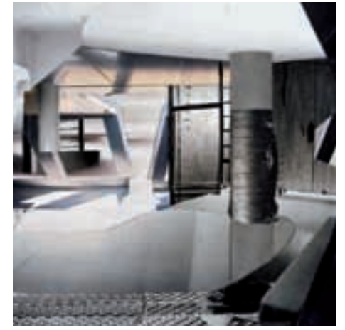
"Es ist so wie es scheint" (Anita Witek, "Die Reise der Fotografin", 2007/2008)

future generations of this gargantuan biohazard. To this end, in 1990, a group of advisers, including scientists, linguists, anthropologists, writers, and artists, was tasked with designing a marking system that could last as long as the site: 10,000 years – a mere drop in the ocean considering the overall life span of the material deposited there but still a challenging timeframe for our imagination.