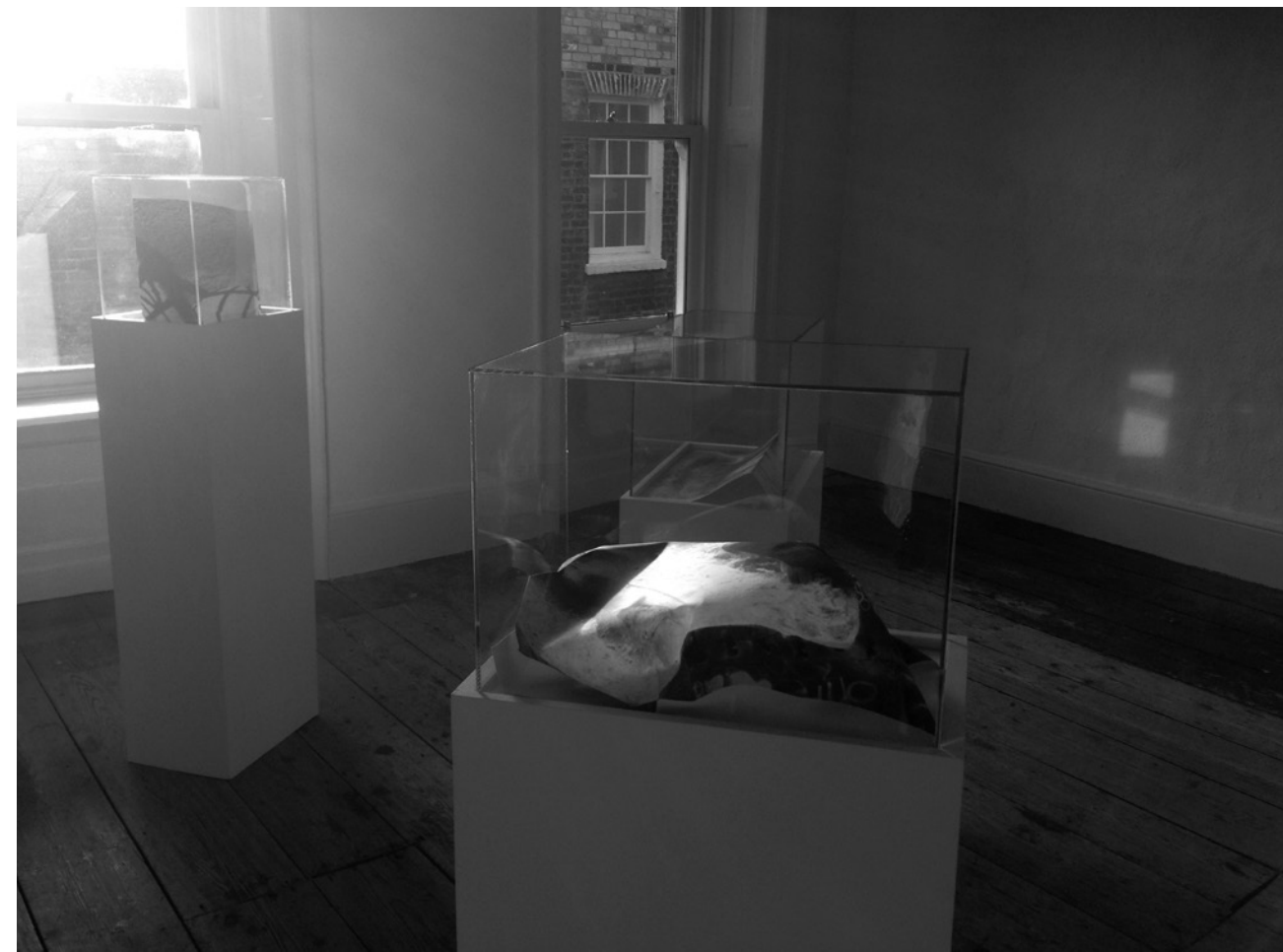
Debby Lauder, The Fold (2014)