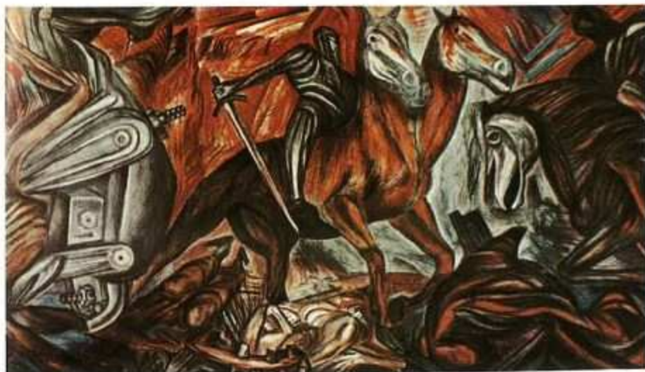
OPPOSITE, FROM ABOVE: Miguel D'Arienzo, The Conquest , 1992, Private Collection; Miguel D'Arienzo, The Rape of America , 1993, Durini Gallery, London; ABOVE: Chamuco and La Llorona; LEFT: José Clemente Orozco, La Conquista , 1938-39, Guadalajara, Jalisco, Hospicio Cabañas.