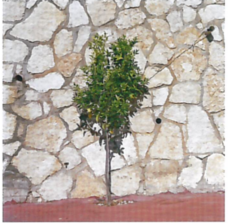
Cover Untitled from Wounded , 2013 Above Untitled from Gardening the Suburbs , 2014