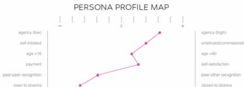
Figure 2: Persona 1 - Mark, 35, Artist. Toyfan, UAL (Graffolution, 2015).

Beyond any regional cultural, social, historical etc. differences, the personas work to reflect personal features which repeatedly proved to surface as common and significant among different graffiti related interviewees, and which proved notably different in other cases. After the whole iteration process, three main trends or profiles were found. The organisation of the personas is made around their social and demographic background, their relationship with graffiti (background, practice, risk & efforts), their view on legal practice and prevention and future vision. According to these criteria, three persona profiles have been found and are described below.