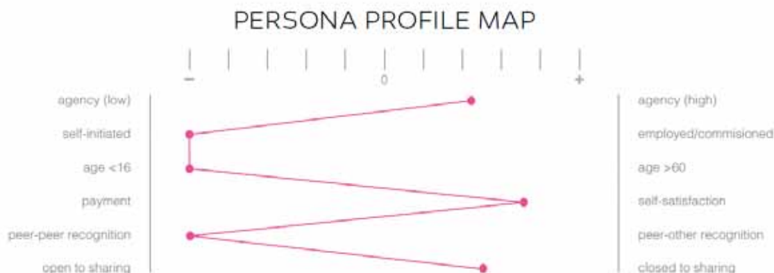
Figure 4: Persona 3 - Mr X, 15, Graffiti writer. UAL (Graffolution, 2015)

The aim is self-recognition and peer-to-peer recognition. The crew is fundamental and he holds the more closed position to sharing.