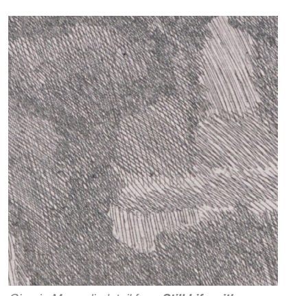
Giorgio Morandi, detail from Still Life with Vases, Bottles etc. on a table (1929), etching, 15 x 20.5 cm. Estorick Collection, London, UK / Bridgeman Images. ©2015 Artists Rights Society (ARS), New York / SIAE, Rome.

The image is particularly atmospheric; there are no discernible outlines, so the shapes of the objects seem to shimmer nervously and vibrate. The patches of crosshatching act like Cezanne's brush marks, marking a space against which another patch of tone nudges up until