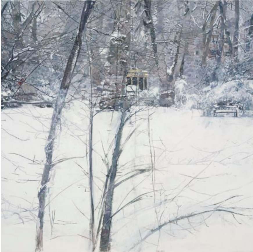
Bryanston Square 2, 2011 oil and charcoal on paper, 128 x 127 cm