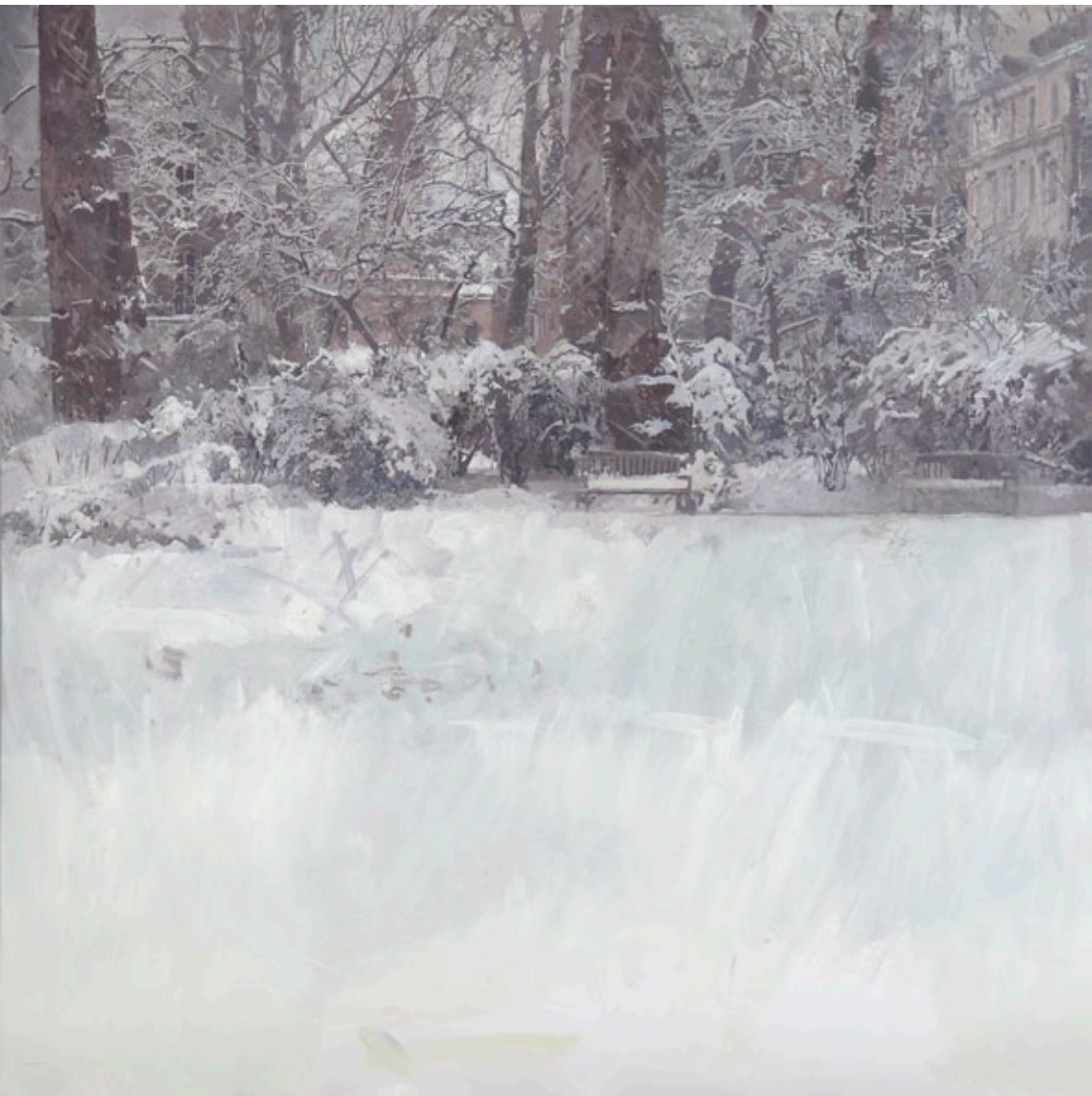
Bryanston Square I, 2009 oil and charcoal on paper, 128 x 127 cm