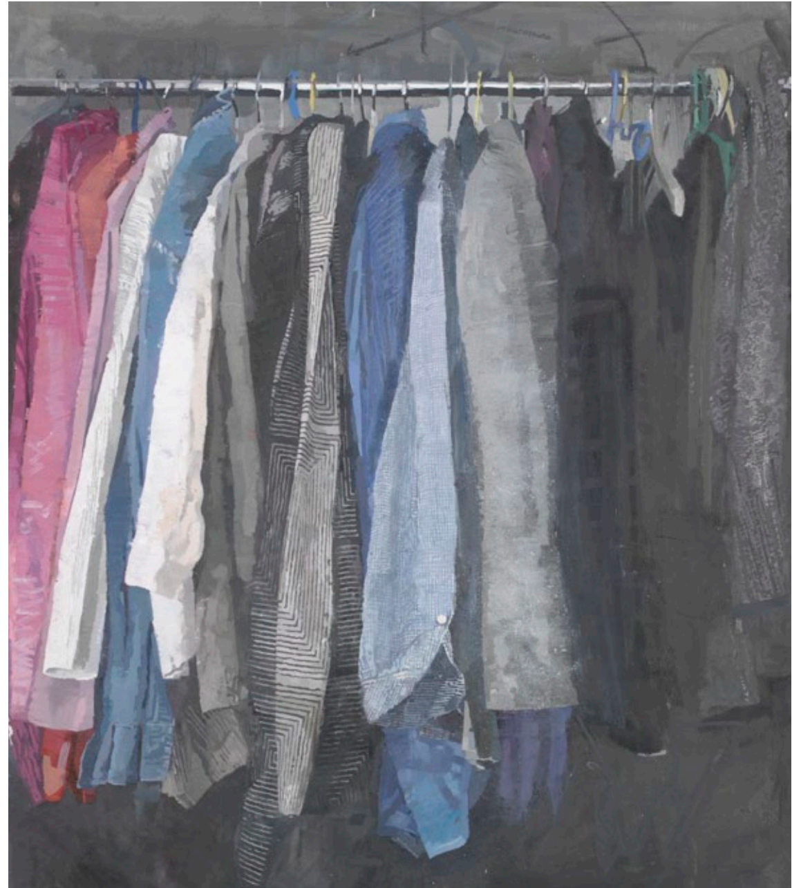
Self-portrait through wardrobe 1, 2014, oil and wax on paper, 60 x 66 cm