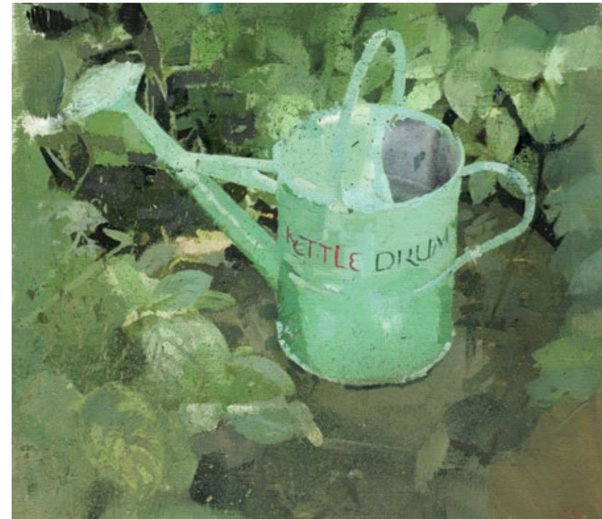
Kettle Drum, 2012, oil on paper, 15 x 15 cm