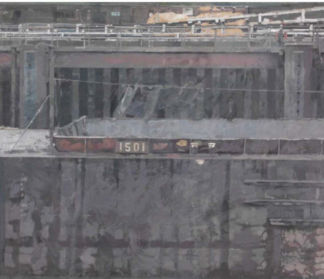
Trinity Buoy Wharf I, 2015 oil and wax on paper, 66 x 66 cm