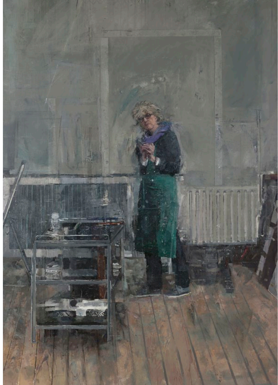
Self-portrait in Pembroke Studios (work in progress), 2015

Brigham University Utah, British Library, Buffalo University New York, Cambridge University Library, Esme Fairbairn Trust, Gleeson Library University of San Francisco, Government Art Collection, Graves Art Gallery Sheffield, Greater London Council, Haarlem Stadsbibliotheek, Houghton Library Harvard, Imperial War Museum, Kent County Council, The Library of Congress Washington DC, London Borough of Camden, National Library of Australia, Newberry Library Chicago, Nuffield Foundation, Penguin Art Collection, Rijksmuseum-Meermanno Hague, Sheffield City Art Gallery, Stanford University, Tullie House City Museum Carlisle, Victoria & Albert Museum, University of the Arts London, University of Guildford, University of Tulsa Oklahoma, Wake Forest University North Carolina, Williamson Art Gallery and Museum, Merseyside, Yale Center for British Art.