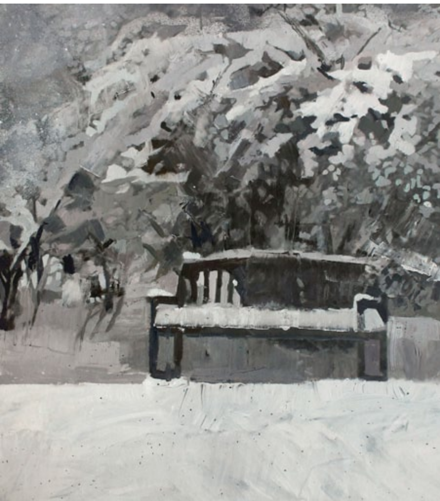
Bench, Edwardes Square, 2014 oil on paper, 18 x 18 cm