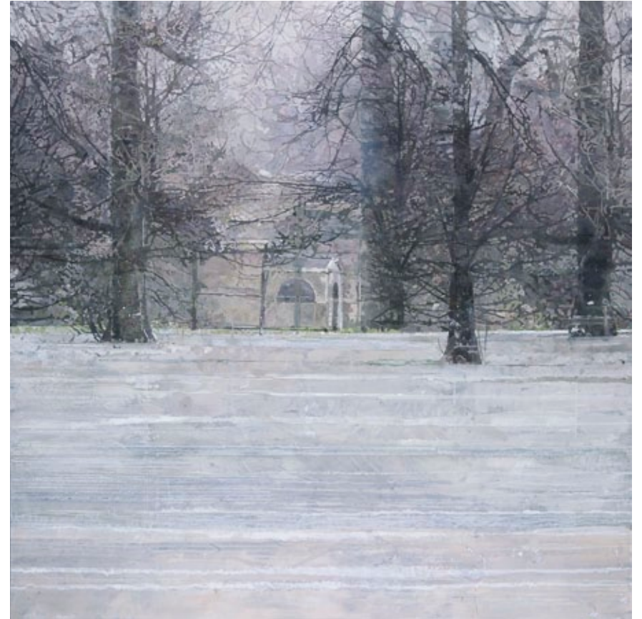
Queen Caroline's Temple, Kensington Gardens, 2014 oil and charcoal on paper, 128 x 127 cm