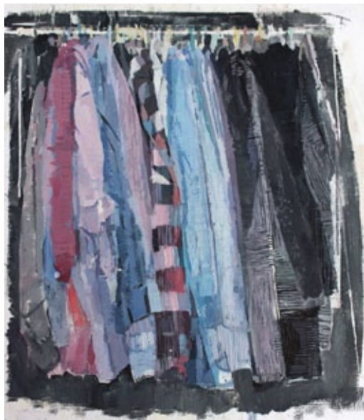
Self-portrait through wardrobe 4, 2015 oil and wax on paper, 19 x 21 cm