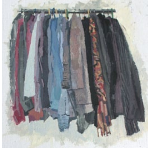
Self-portrait through wardrobe 3, 2015 oil and wax on paper, 13 x 13 cm